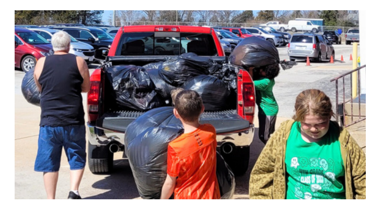
The K-Kids bagged the remaining clothing and carried the bags to a truck to load, donating them to a Back to School event. The Union Kiwanis Club sponsors the Beaufort Elementary K-Kids.

The Beaufort Elementary School K-Kids sponsored a community clothing swap in March. Families of students in the school and community members, including Union Kiwanians, donated clothes. K-Kids sorted the clothes by sizes and organized them on tables for display. School classes were first to "shop" and later community members had the opportunity to select clothes. K-Kids bagged the remaining clothing and carried the bags to a truck to load.