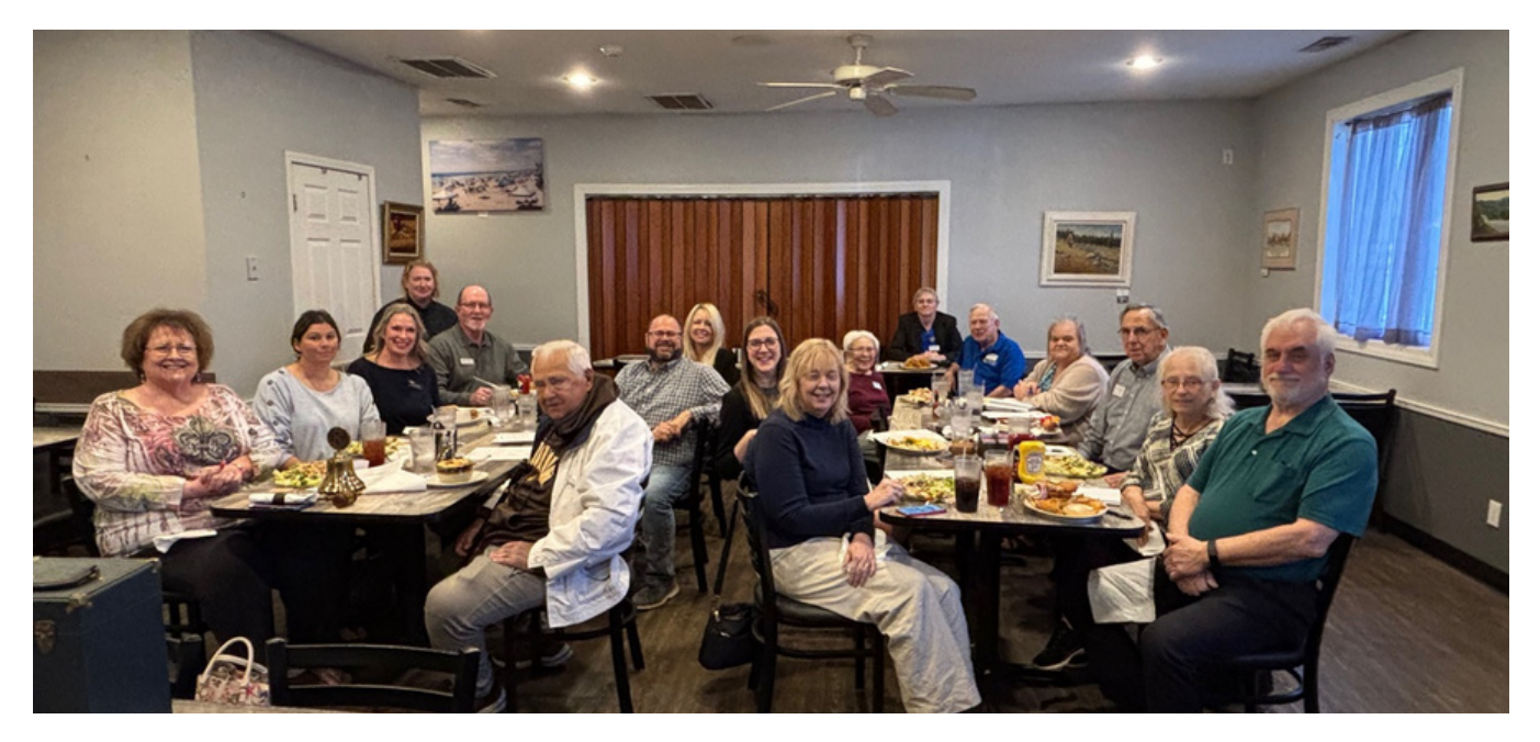
INTERCLUBBING "ROUND ROBIN" STYLE. THE CAMDENTON, OZARK COAST AND THE SEDALIA MET FOR A COMBINED MEETING ON MARCH 25, 2025. WITH ALL OF THE DIVISION 11 CLUBS PRESENT THIS QUALIFIED THEM FOR THE ROUND ROBIN ON THE INTERCLUB SCORE.