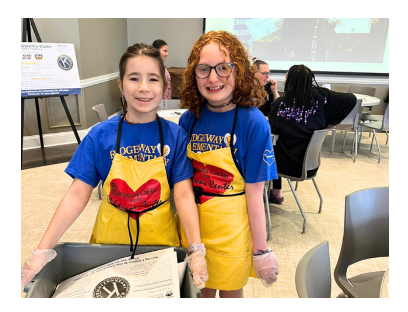
One highlight were lots of young volunteers from the Ridgeway Elementary K-Kids which was created this school year.

K-Kids from three local elementary schools helped work in the dining room. The event was promoted on local radio during the week leading up to the event and featured local celebrity servers from those sponsoring stations.