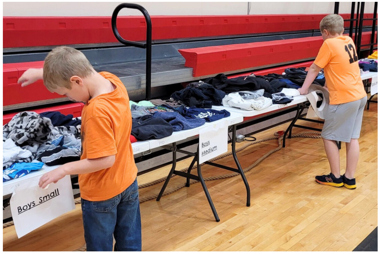
PICTURED ARE BEAUFORT ELEMENTARY SCHOOL BOYS "SHOPPING" FOR CLOTHES, K-KIDS MEMBERS GETTING CLOTHES BAGGED AND K-KIDS CARRYING BAGS TO LOAD THE TRUCK.

K-KIDS CLOTHING SWAP: BEAUFORT ELEMENTARY SCHOOL