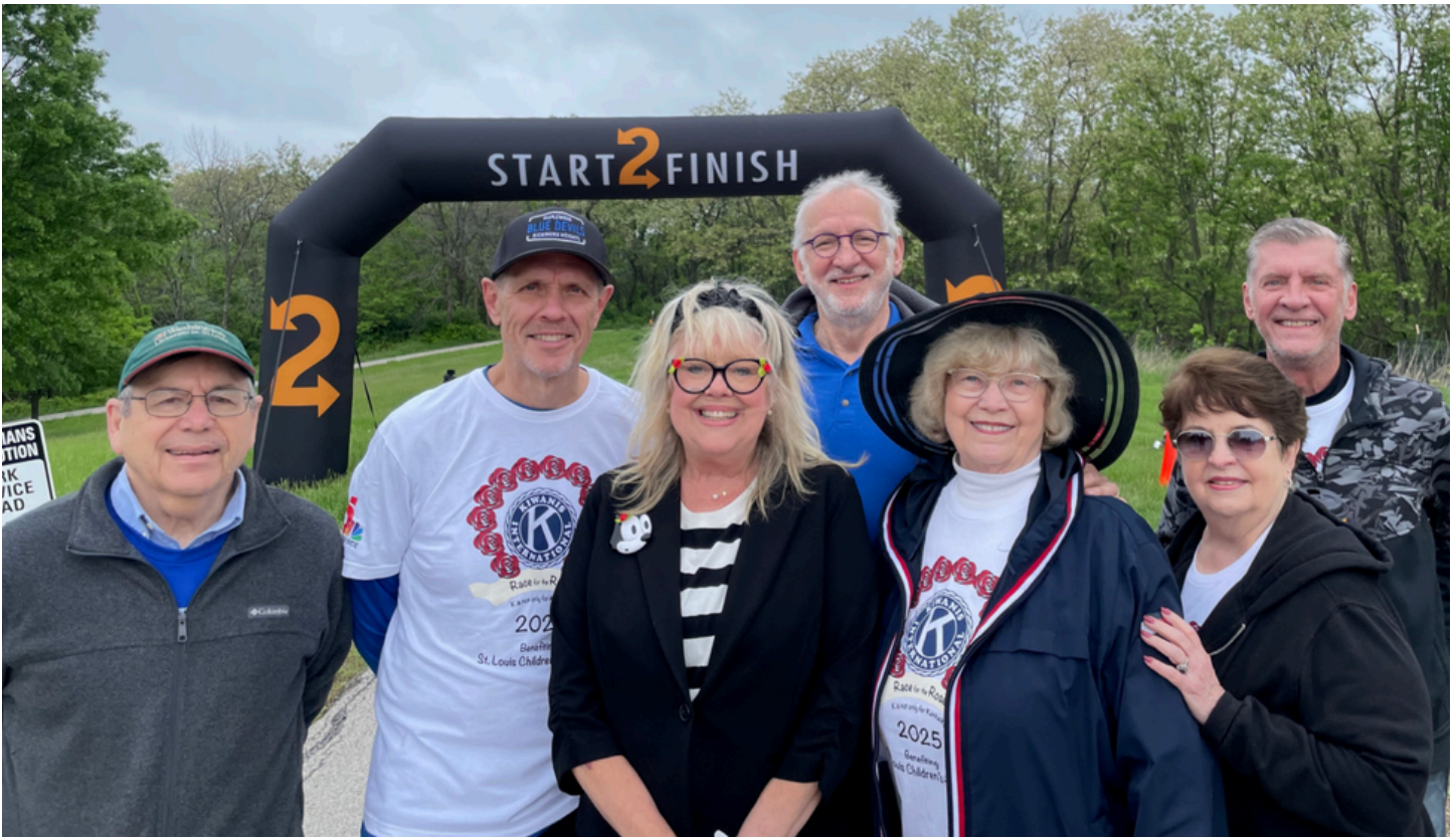
MAPLEWOOD KIWANIS CLUB VOLUNTEERS AT THE RACE FOR THE ROSES