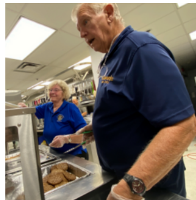
I had the honor of serving at a Maplewood Kiwanis Pancake Breakfast.