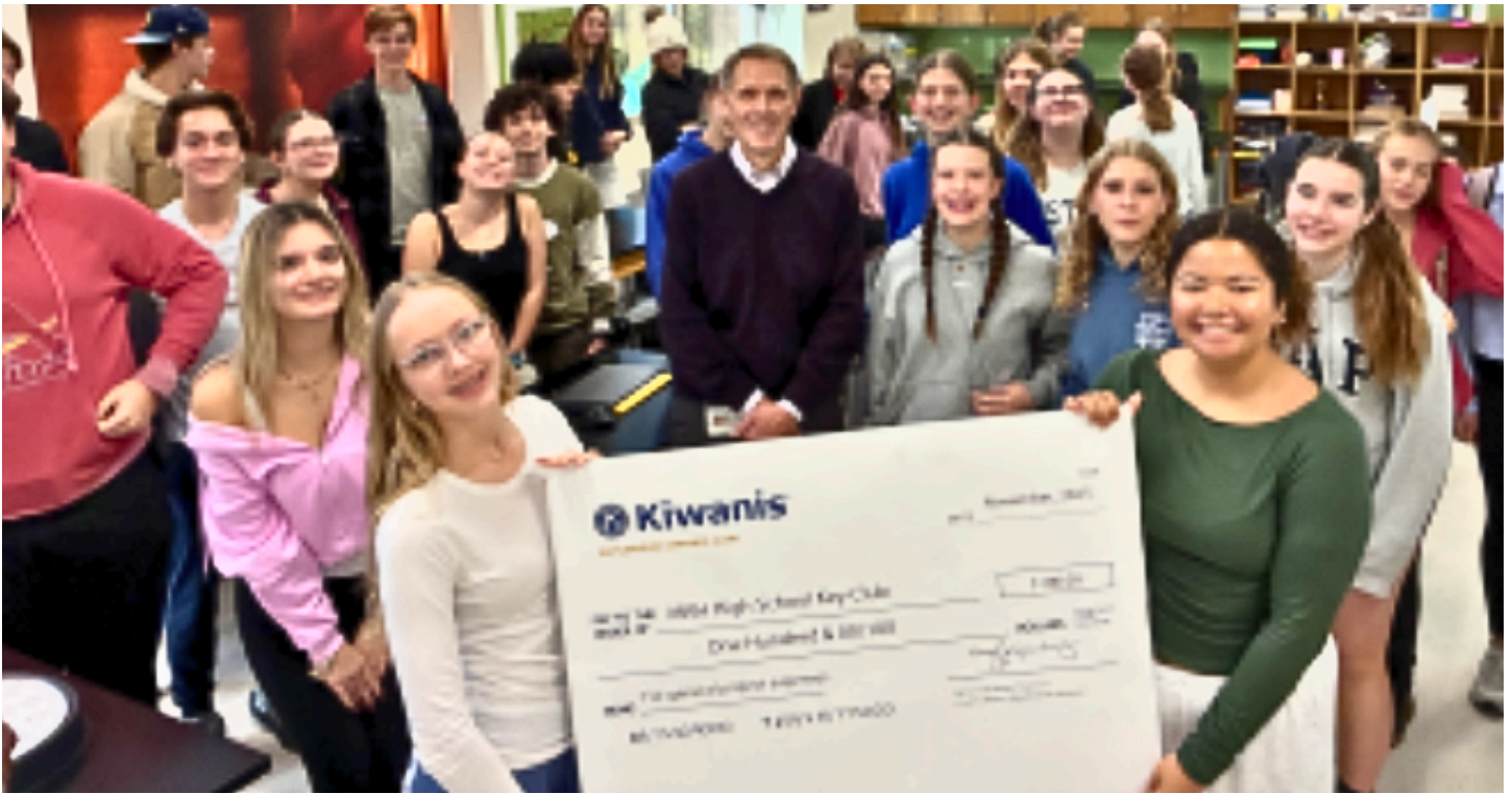
TWO CELEBRATIONS AT MAPLEWOOD KIWANIS CLUB.