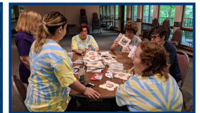
Above: (1) Picture of Pennsylvania Aktion Club members attending the 2018 Pennsylvania Aktion Club Convention. (2) Members participate in a service project at the annual convention.