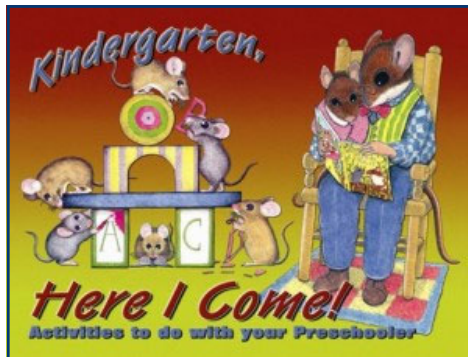
Above: Pictures of the various Early Learning Guides available for distribution.