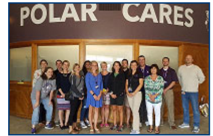
Above: (1) POLAR CARES clothing and toiletries are stocked on shelves. (2) POLAR CARES counselors gather for a picture.