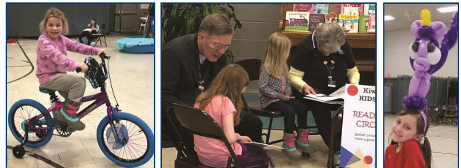
Above: (1) Winner of the girl's raffle bike shows her excitement. (2) Kiwanian read to children at the reading circle set-up. (3) A child poses with her balloon animal.