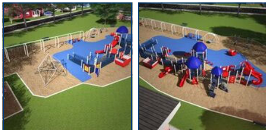
Left: Photo renderings of the planned. Kids United Community Playground.

Kids United Community Playground is a collaborative community project to create a playground where disabilities disappear and inclusive play is promoted for all children, enhancing the quality of life of children and families through fitness and socialization. The club is building a positive, healthy, fun environment inspiring our community to learn, imagine, and play together. The playground will be built at Thaddeus Stevens Primary School centrally located in the city limits. The playground will offer a safe place for families to gather in a low-income section of the city for leisure and physical activity.