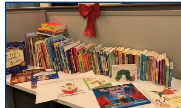
Above: (1) Children enjoying the lending library books. (2) Lending books displayed for children’s selection.