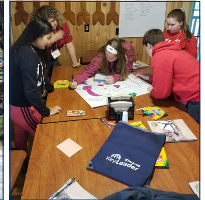
Above: (1) Picture of the students at Pennsylvania Key Leader 2018 at Camp Conrad Weiser in Wernersville, Pennsylvania. (2) A Key Leader team of students designs a team poster for the weekend.