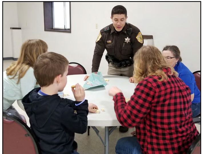
As a result of a collaboration between the Kiwanis club, the library and the sheriff's department, a community game night was held in Cambria.

The sheriff's office participated in the Kiwanis 'n Cops 'n Kids program and exceeded expectations by sending several deputies, including a K-9 unit. They stayed and