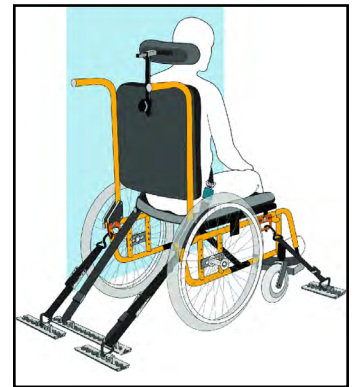
The need for picnic tables at Camp Hometown Heroes has been met, so Governor Larry Koziol has turned his focus to wheelchair tie-downs and other accessibility and safety needs at Easter Seals Camp Wawbeek.

Attaching the proper tie-downs will cost approximately $4,500. Two new tarps will cost $1,500 plus an additional $500 for roll-up accessories to make the tarps work best on sunny days. There is also a strong possibility that four trailer tires will need to be replaced at a cost of $100 each. Additionally, safety chains that attach the wagons to the tractors may need to be replaced or re-welded at a cost of approximately $300. The estimated total cost of the project is $7,200.