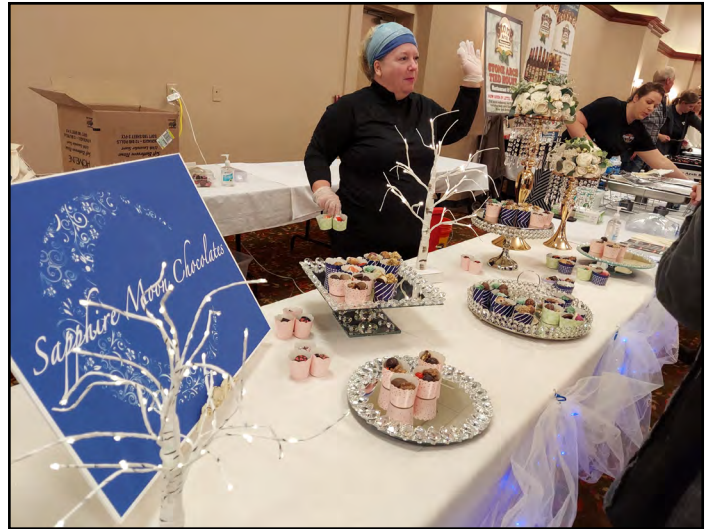
A gourmet chocolatier from Appleton displays her creations at the Taste of the Town fundraising event benefiting the Kiwanis Club of Darboy.

Tickets for the event included samples from all of the participating vendors, entry into the grand prize drawing featuring prepaid cash cards, and a chance for door