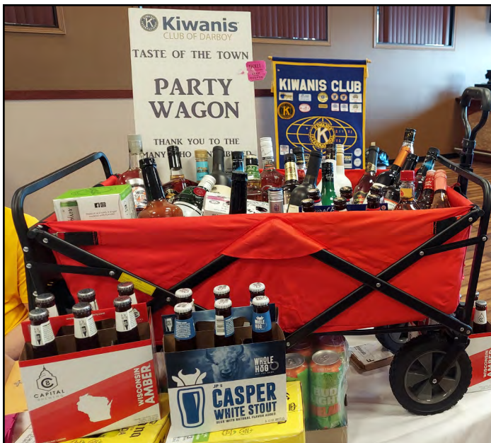
A "party wagon" filled with adult beverages is one of the raffle prizes available at the Taste of the Town fundraising event in Darboy.

Proceeds from the event help fund scholarships, student service organizations, iPads for children on the autism spectrum and the club's other outreach efforts.