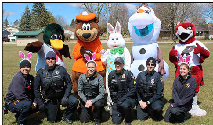
Local mascots joined the Easter Bunny and emergency personnel at the Ripon Early Bird Kiwanis Easter Bunny, Bags & Books event in April.

Cars waited up to an hour for their turn to drive through to see the bunny and other characters. Members heard that the kids loved it and that it was worth the long wait!