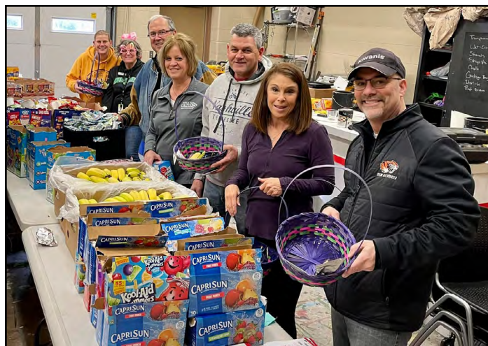
Volunteers filled treat baskets to give to more than 350 children who attended the Easter event hosted by the Kiwanis Club of New Richmond.

The Kiwanis Club of New Richmond hosted an annual Easter event on Saturday, April 16. Volunteers braved the