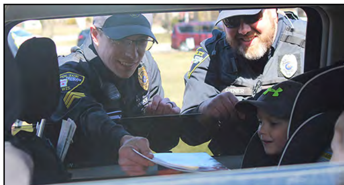
Police officers participated in the Kiwanis 'n Cops 'n Kids program, handing books to children as their parents drove them through the park.

Ripon emergency personnel took part in the Kiwanis 'n Cops 'n Kids program by distributing 325 books to children as they made their way through Barlow Park.