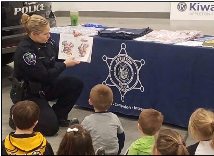
A police officer reads to children at the Fox Cities Kidz Expo, bringing the Kiwanis 'n Cops 'n Kids program to the event for the first time.

When the Kidz Expo was originally created, the goal was to provide a free event for families that was educational, fun and adventurous. Club members feel that the annual event has become an established part of the fabric of the community and they look forward to hosting it again.