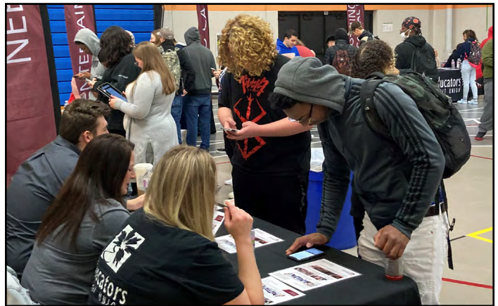
Students visited "life stations" to help determine a budget based on the career, salary, family status and credit score each had been assigned.