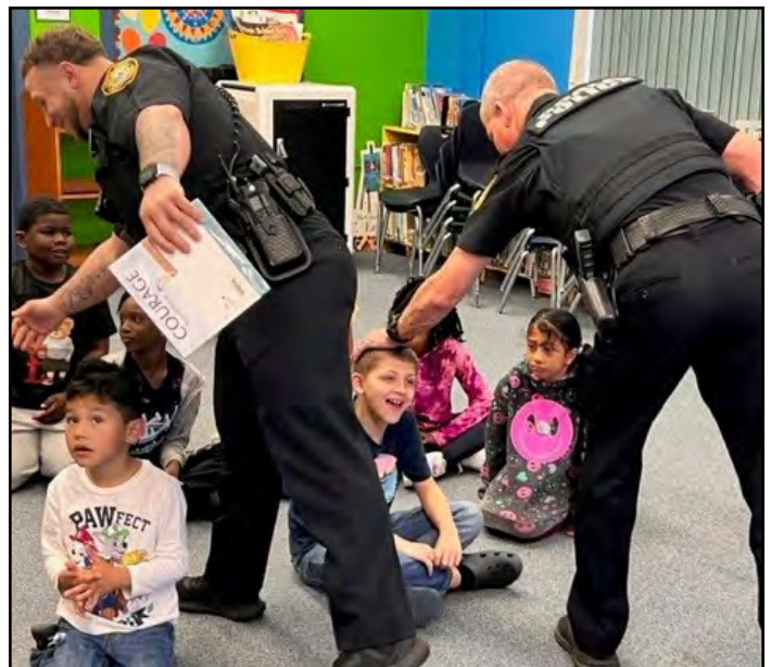
Positive interactions with police officers help build trust so that if children are in an emergency situation, they are less afraid.

The children enjoyed having a book on "Courage" read to them by officers from the Ocala Police Department.