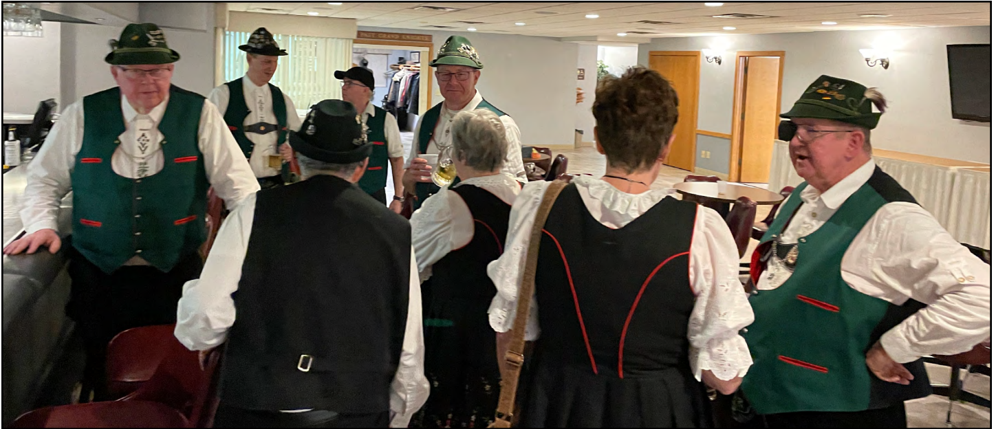
Bavarian-style costumes were featured at the West Bend Noon Kiwanis German Night event held March 31st.