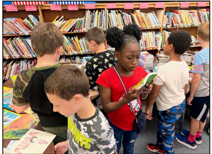
Children were very excited to receive a book of their very own!

Recently, the Kiwanis District Governor in Florida launched Kiwanis 'n Cops 'n Kids in the Sunshine State. What follows is a report from a club in Ocala, Florida: