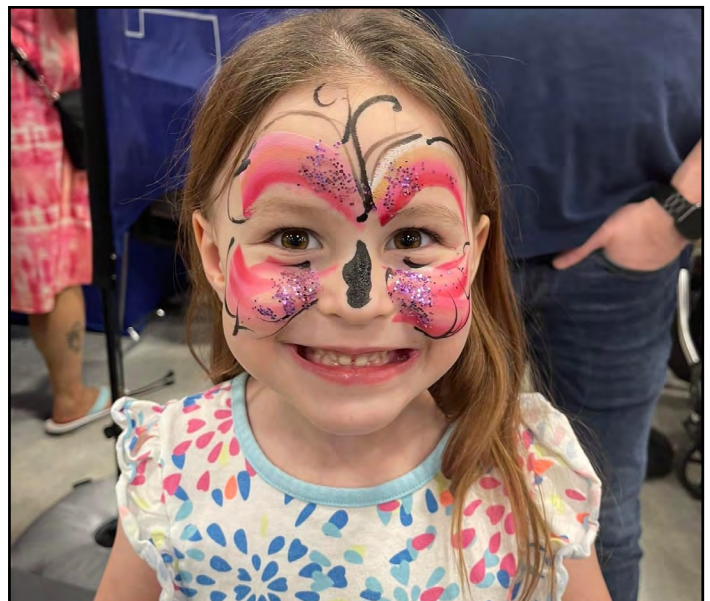
Face painting was a big hit among those in attendance at the Kidz Expo.

For more information on this year's event, visit the event website at www.FoxCitiesKidzExpo.com or check the event out on Facebook at "Fox Cities Kidz Expo".