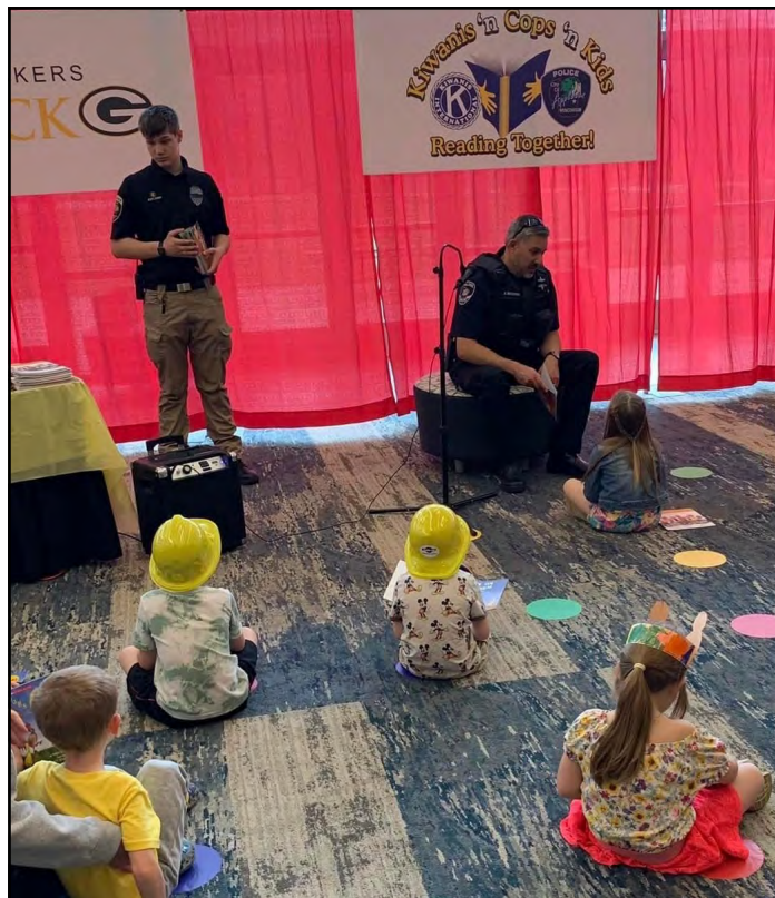
Police officers participated in the Kiwanis 'n Cops 'n Kids program at the Fifth Annual Appleton-Fox Cities Kiwanis Club's Kidz Expo.

This year the Fox Cities Kidz Expo provided more than 70 activity booths, displays and activities, mascots, balloon artists, community service vehicles, food concessions and face painters that engaged with attendees during the event, and an entertainment stage that was active with demonstrations, music, magic, dancing and fun. Kiwanis 'n Cops 'n Kids Program readings were scheduled to connect attendees to other Kiwanis-branded children-focused initiatives.