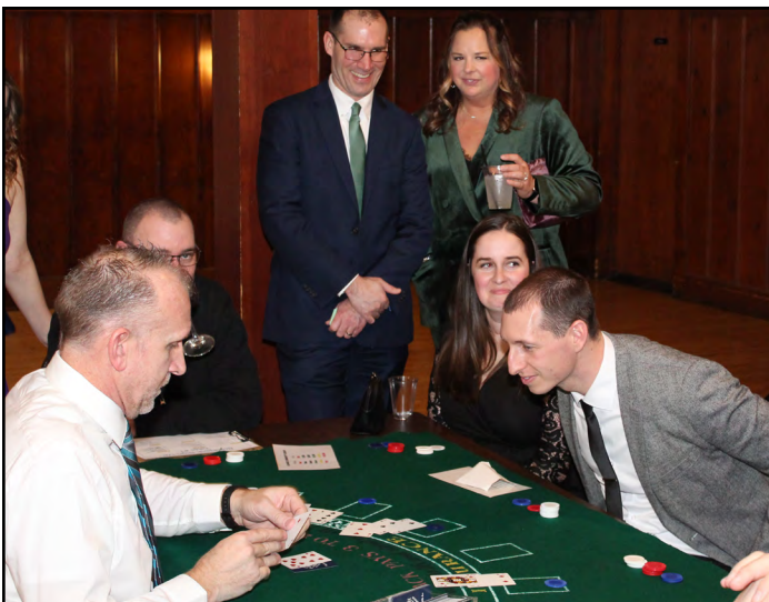
Blackjack was just one of the many fun offerings at the Kiwanis Club of Slinger's Winter Gala.

The Kiwanis Club of Slinger is proud of its progress and is confident that the club will only get stronger in its service work because kids need Kiwanis!