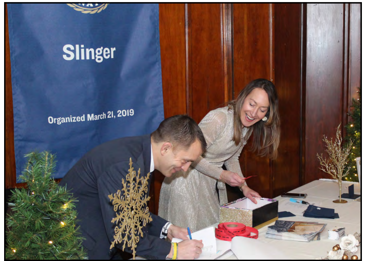
Kiwanis Club of Slinger members enjoyed volunteering while raising money at the club's second annual Winter Gala.

The club also committed to planning for the future by brainstorming possibilities for an annual signature project – and that's how the Slinger Kiwanis Winter Gala was born. This event came to life in a welcomed, post-