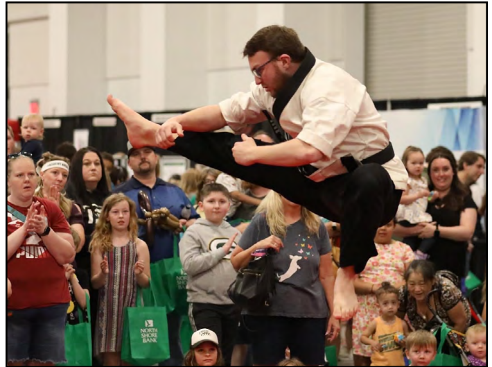
A martial arts demonstration amazed onlookers at the Fifth Annual Appleton-Fox Cities Kiwanis Kidz Expo.

The Appleton-Fox Cities Kiwanis Club, in partnership with Northshore Bank, welcomed more than 4,000 attendees to the Fifth Annual Fox Cities Kidz Expo held April 15th in downtown Appleton. This year's theme "A Day in Motion," was chosen to create a welcoming environment that provides a combination of recreation and education while promoting family bonding and togetherness. The club's vision was that the "Day in Motion" theme would afford the opportunity to promote other local businesses and family resources and give back to the community by offering a free, family-friendly event.