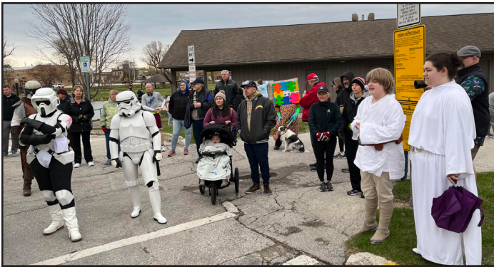
Members of "Vader's Fist" participated in the fun run/walk, greeting participants as they crossed the finish line.

The Greater Sheboygan Club and Sheboygan Falls club split the proceeds, which will fund the purchase of approximately 30 iPads with protective cases and educational apps. iPad presentations continue throughout the Wisconsin-Upper Michigan Kiwanis District with 1,420 iPads awarded since 2012.