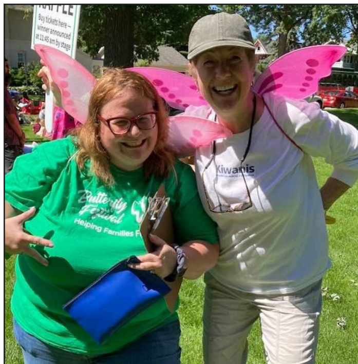
Kiwanis members have fun selling raffle tickets at the Fox Cities Butterfly Festival, which provides fun, educational adventures for children while raising funds for the Kiwanis district's signature projects.

The Fox Cities Butterfly Festival is a free community event featuring more than 30 activity booths, displays, activities, play areas, an entertainment stage, face painting, giveaways, food and more!