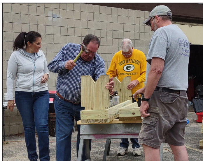
Kiwanians assemble benches to be used in the newly-renovated barn at Camp Hometown Heroes.

On June 4th, members from Fabulous Fond du Lac, Kewaskum, Slinger and West Bend Early Risers Kiwanis clubs, along with camp staff and Circle K members from UW-Green Bay, UW-Whitewater and Michigan Tech, gathered to assemble the tables and benches. Once an assembly line was organized it was smooth sailing with about four hours allocated to assembly. What a great time spent in service and fellowship!