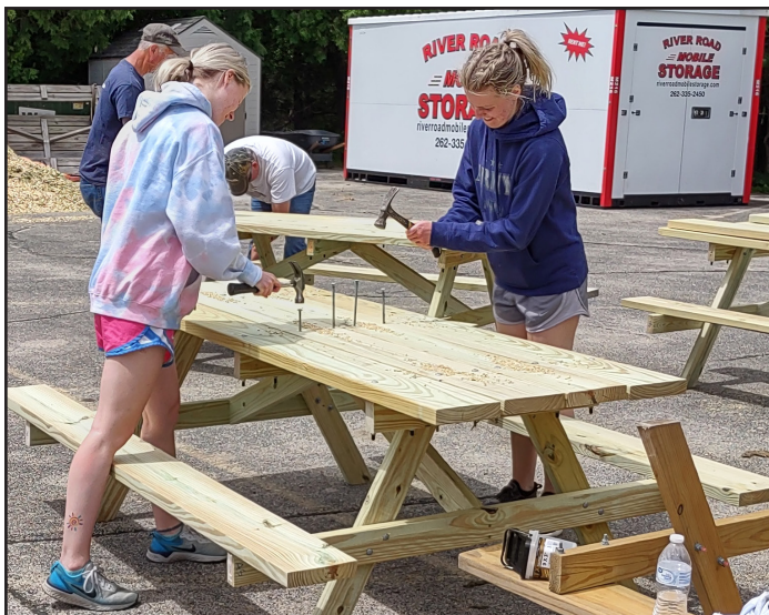
Circle K members put the finishing touches on the picnic tables.