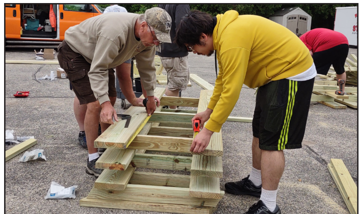
An assembly line method was used to construct the picnic tables and benches for Camp Hometown Heroes.

Now that the picnic tables are finished, won't you please consider helping us with part two of the Governor's Project? We will use any additional funds to help with getting wheelchair tie downs for the trailers used for campers at Camp Wawbeek. The total amount needed is $7,200 and any amount your club can give will be greatly appreciated. Checks should be made payable to the Kiwanis District Foundation with "Governor's Project" in the memo. Thanks for all you do for the kids!