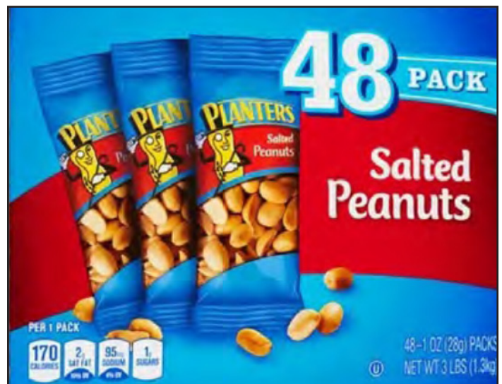
Distributing peanuts, pretzels and gummi bears on Kiwanis Peanut Day can be a very successful method of raising funds.

Clubs also ask businesses to sponsor peanut sales and are given product to distribute. Service Leadership Program members are a great source of volunteers, too. I sold my first Kiwanis peanuts when in 7th grade.