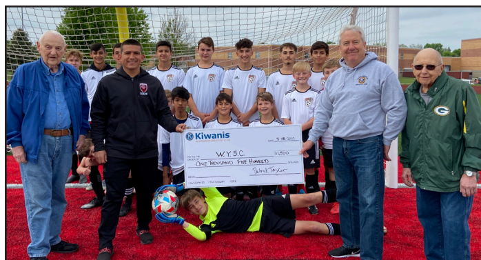
Members of the Whitewater Breakfast Kiwanis Club donated $1,500 to the Whitewater Youth Soccer Club program. Members of the U15 and U8 boys soccer teams were present when the donation was made.