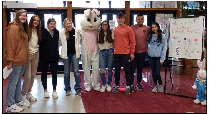
Key Club members at Cambria-Friesland High School assisted the Kiwanis Club of Cambria with the club's annual Easter Egg Hunt.