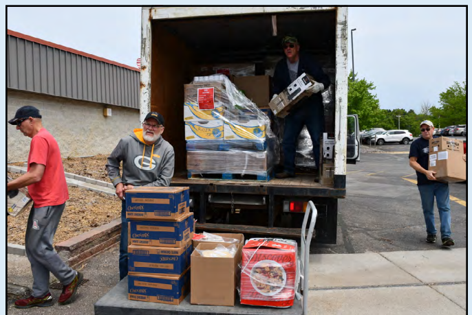
Kiwanis members delivered food for Horner Market at Parkside Middle School, which was distributed to more than 400 families in need.

During the pandemic, Parkside Middle School students began collecting food donations to be shared with families in need. The project grew, and this year they asked the Wautoma Area Kiwanis Club for help. In response, once a week, Kiwanis members picked up food for Horner Market from a central location and delivered it to the school. More than 400 families were served by the market. Recipients were able to shop once each week during the school year. Club members are proud to partner with the students on this effort to feed those struggling with food insecurity in the Wautoma area!