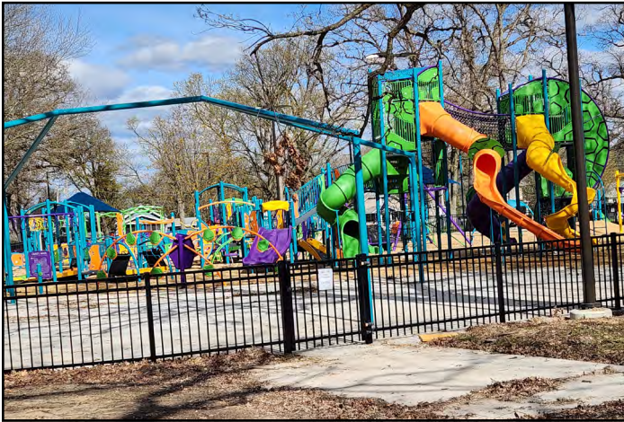
Platteville's new inclusive playground was supported by a matching grant from the WI-UM Kiwanis District Foundation and Platteville Kiwanis Club.

In June, 2023, the grand opening of the Platteville Inclusive Playground was held and hundreds of parents and children took part in the event. Since then, the facility is occupied to near capacity every day.