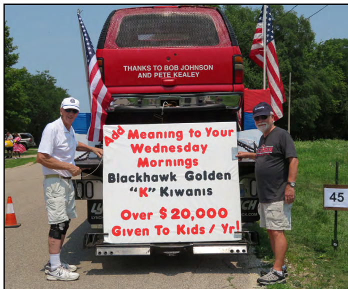
Kiwanians take advantage of the opportunity to encourage new members while simultaneously promoting the Truck on Ice fundraiser.

Ticket sales by members, table sales and sponsorship monies are collected and recorded. When the ice is thick enough, the truck is put in place. In the rare years that ice doesn't reach the required thickness, a raffle system is used and winners are drawn randomly.