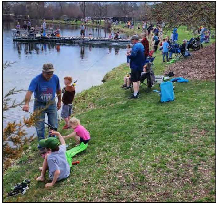
Kids, parents, grandparents, and community members enjoyed the free fishing clinic hosted by the West Bend Early Risers Kiwanis Club.

The Outdoor Heritage Education Center's "touch of the wild" trailer was very popular. 60 new rod and reel combos were raffled off along with fishing clinic t-shirts.