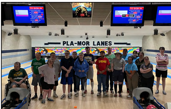
Aktion Club members came together on June 3 at Chilton's Pla-Mor Lanes to raise money to purchase iPads for children on the autism spectrum, in support of the district's iPads for Autism Signature Project.