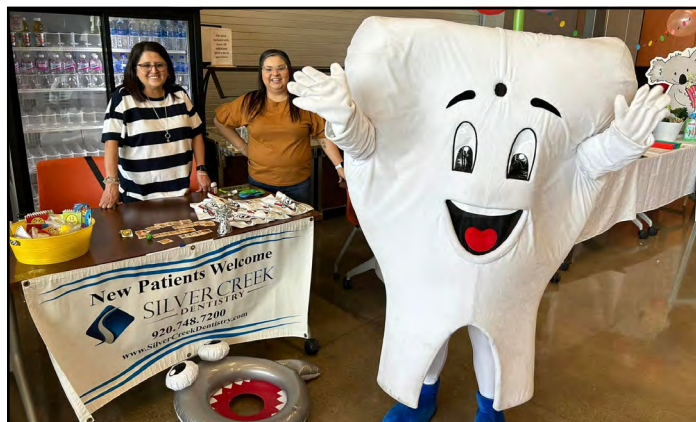
A dental clinic's mascot entertained kids while parents were afforded the opportunity to receive oral hygiene information and resources.

Additionally, the fair encouraged a sense of unity and collaboration, as attendees had the opportunity to meet and engage with representatives from various sectors. Families discovered new avenues for enrichment and explored activities that catered to their children's interests, helping them make informed decisions about their child's future.