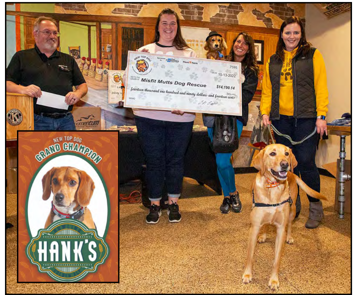
One of the 2022 NEW Top Dog contest winners raised $14,190 for the Misfit Mutts Dog Rescue. Inset: The beer label design for Hank's Golden Ale – the beer crafted in honor of the overall NEW Top Dog – is shown.

Signing on major sponsors such as Fleet Farm and Fox Communities Credit Union – as well as creative strategies