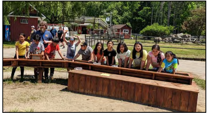
Nicolet School students enjoyed a fun-filled day at the NEW Zoo in Green Bay.