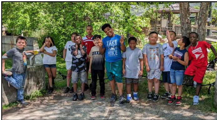
The Green Bay Kiwanis Club has sponsored a field trip for third-grade students to the NEW Zoo for many years.

As the day concluded, the children returned to school with many cherished memories and newfound knowledge. The Kiwanis club takes pride in building connections and community spirit through such events, nurturing young minds and inspiring a love for exploration and learning.