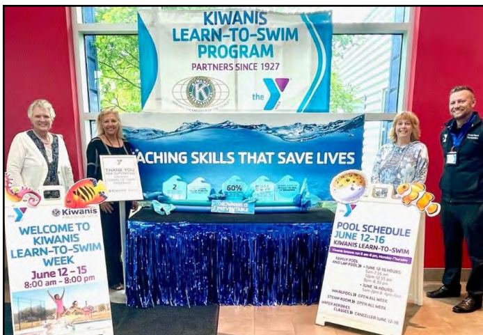
The Fond du Lac Noon Kiwanis Club takes advantage of the opportunity to promote the mission of Kiwanis during its annual Learn to Swim event.