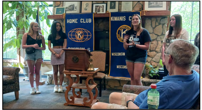
Members of the Wisconsin Dells High School Key Club who attended the Key Club District Convention addressed Wisconsin Dells Kiwanians about their experiences during the club's meeting on May 22, 2023.