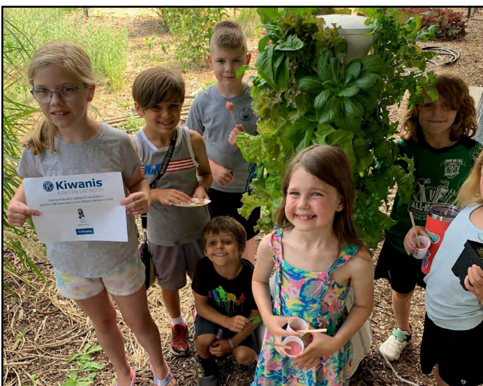
Fond du Lac Noon Kiwanis is proud to be a partner on this Farmstand educational project. The excitement of the junior master gardeners as they harvested plants for an afternoon snack was evident.

With the Farmstand this year, the youth will enjoy a new experience, and they will be able to donate more food to the community.