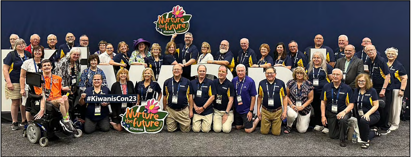
The 2023 Kiwanis International Convention – held in Minneapolis, Minnesota – was attended by 62 members of the WI-UM Kiwanis District. The theme was Nurture the Future. Attendees are looking forward to the 2024 convention to be held in Denver, Colorado.