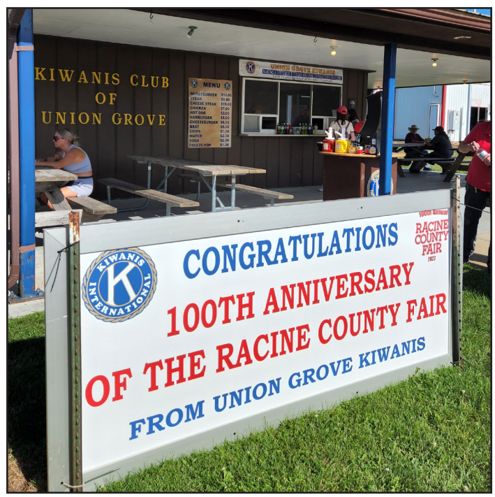
Members of the Kiwanis Club of Union Grove helped celebrate the 100th anniversary of the Racine County Fair in July.

Volunteers from community youth organizations, Key Club members and Kiwanians worked together to serve a record amount of food for the first three days of the fair and matched the amount made from previous years on the last two days. Ten different community youth organizations volunteered to help feed hungry fairgoers. Profits from this year's fair food booth exceeded previous efforts and will go a long way towards helping many of the organizations whose members volunteered.