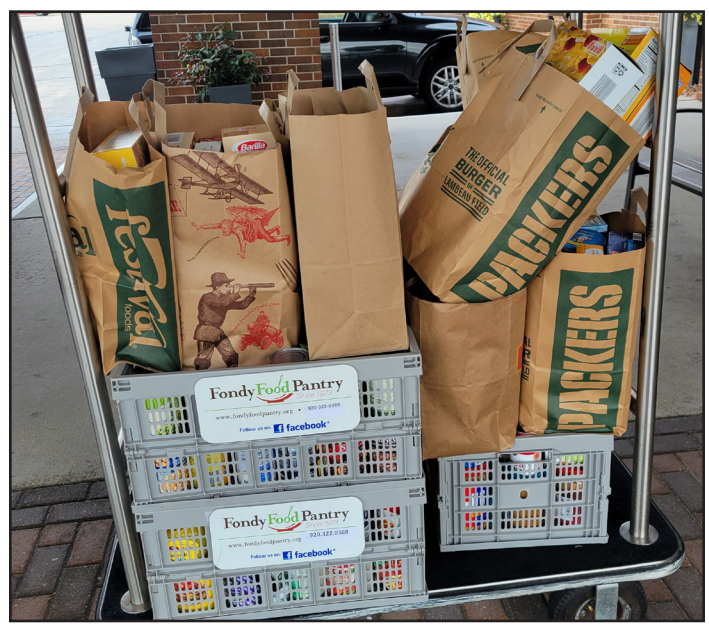
More than 340 pounds of non-perishable food items were donated to the Fondy Food Pantry during the district convention service project.

The Fondy Food Pantry has been providing supplemental healthy food options and education for families in need in Fond du Lac County since 1973. Compassion for children is a hallmark of the pantry, which believes that "strong bodies, strong minds, and positive growth for all kids in our community will always be a priority."