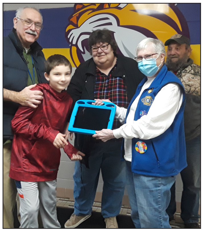
The Wautoma Area Kiwanis Club has awarded 60 iPads to children on the autism spectrum since 2013.

The Wautoma Area Kiwanis Club has been very active in supporting youth of all ages and backgrounds, affording students the opportunity to participate in fun and educational projects since 1982.