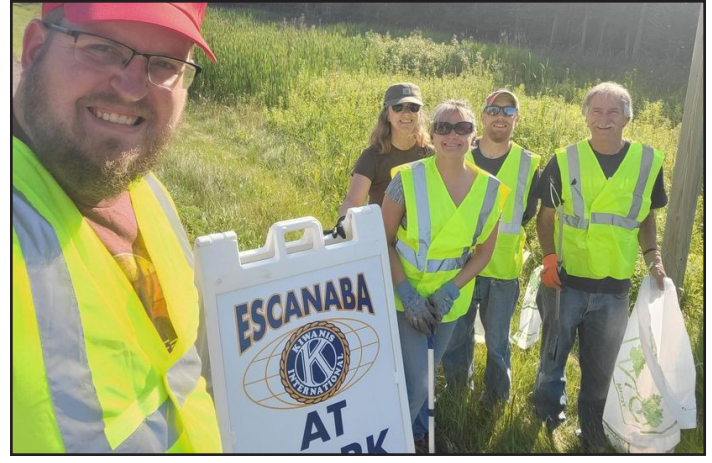
Picking up trash along a two-mile stretch of highway is just one of the many service projects that members of the Escanaba Kiwanis Club take on at least twice each year.

The public is invited. This would be a great opportunity to interclub with Escanaba Kiwanians. Responses are requested no later than Friday, September 16th to eskykiwanis@gmail.com. Full details can be found at www.escanabakiwanis.org.