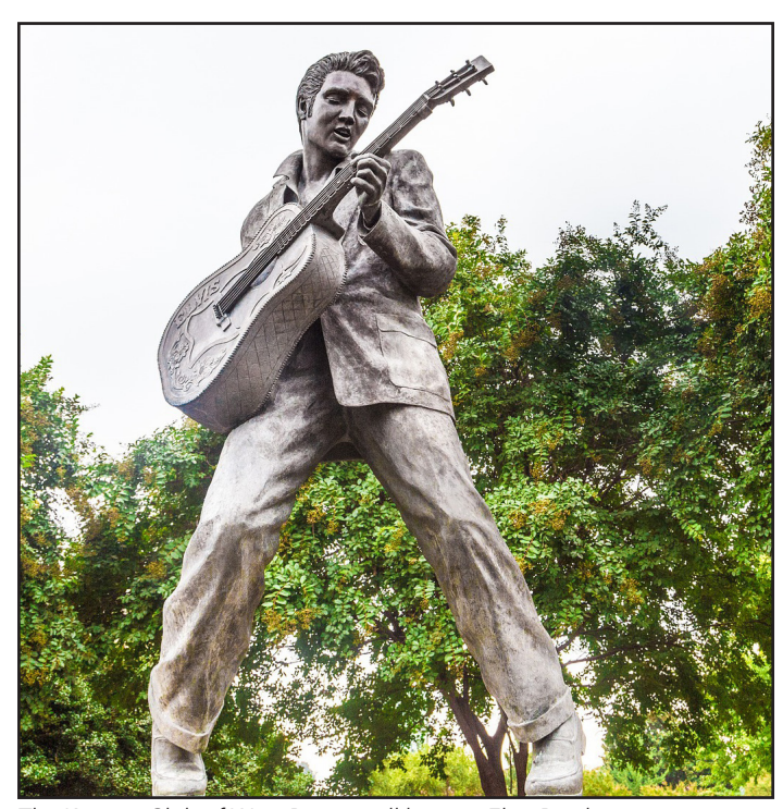
The Kiwanis Club of West Racine will host an Elvis Presley impersonator on Saturday, October 1st. Proceeds of the fundraising event will be split between the Make-a-Wish Foundation and Toys for Tots.