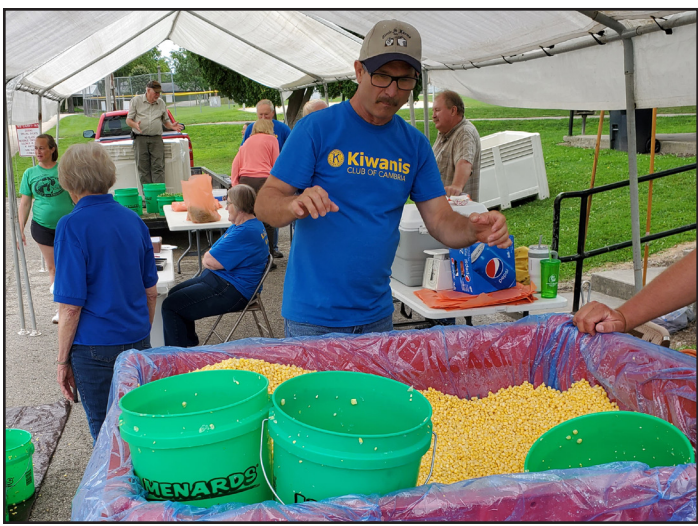
A bin of sweet corn is ready for customers at the Cambria Kiwanis Club annual vegetable sale.

The local community is a strong supporter of the club's fundraiser as they sell to between 300 to 400 customers.