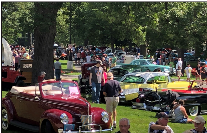
The Kiwanis Club of Appleton-Fox Cities has been sponsoring the Appleton Old Car Show and Swap Meet since 1982.

The annual Appleton Old Car Show and Swap Meet held on Sunday, July 17th, 2022 in Pierce Park is a car lover's dream. Car collectors and enthusiasts at the 44th annual event, the largest free car show in the midwest, viewed more than 1,000 cars dating back to the early 1900s. There were families passing on a bit of nostalgia to their children and grandchildren, and still others just gawking at the sheer coolness of the vehicles.