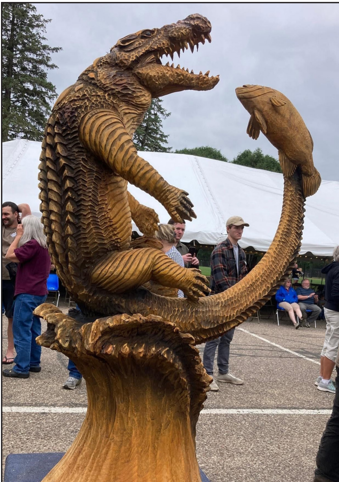
One of the wood carvings on display at the U.S. Open Chainsaw Sculpture Championships held August 11-14 in Eau Claire, Wisconsin.

equipment to learn about the history of logging and its impact on Eau Claire and the surrounding area.