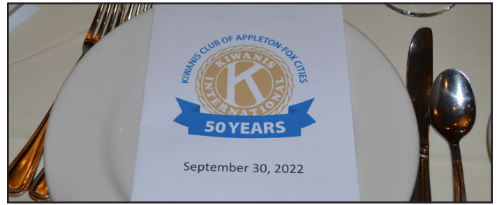
The Kiwanis Club of Appleton-Fox Cities celebrated half a century of serving children and the community on September 30, 2022.