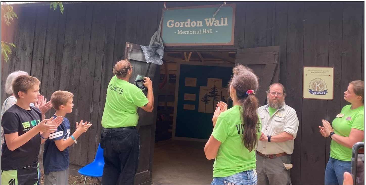
Kiwanis Club of Eau Claire members dedicate the Gordon Wall Memorial Hall at the Paul Bunyan Logging Camp at the Wisconsin Logging Museum.