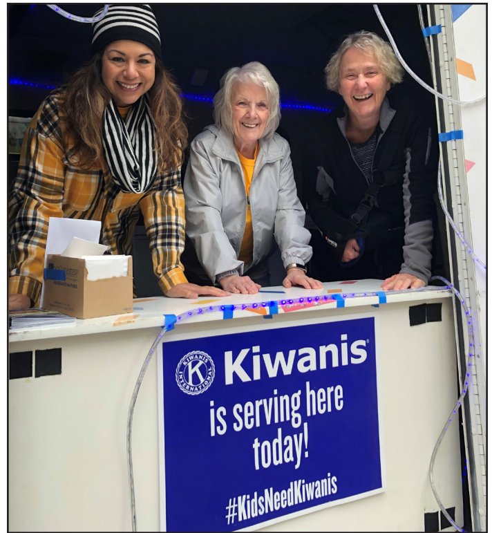
Appleton-Fox Cities Kiwanis members sold Dilly Bars, bottled water and other concessions during the Octoberfest event in downtown Appleton.

Organizers estimated that more than 100,000 people came out to the festival on Saturday, providing a big boost for small businesses in the area.