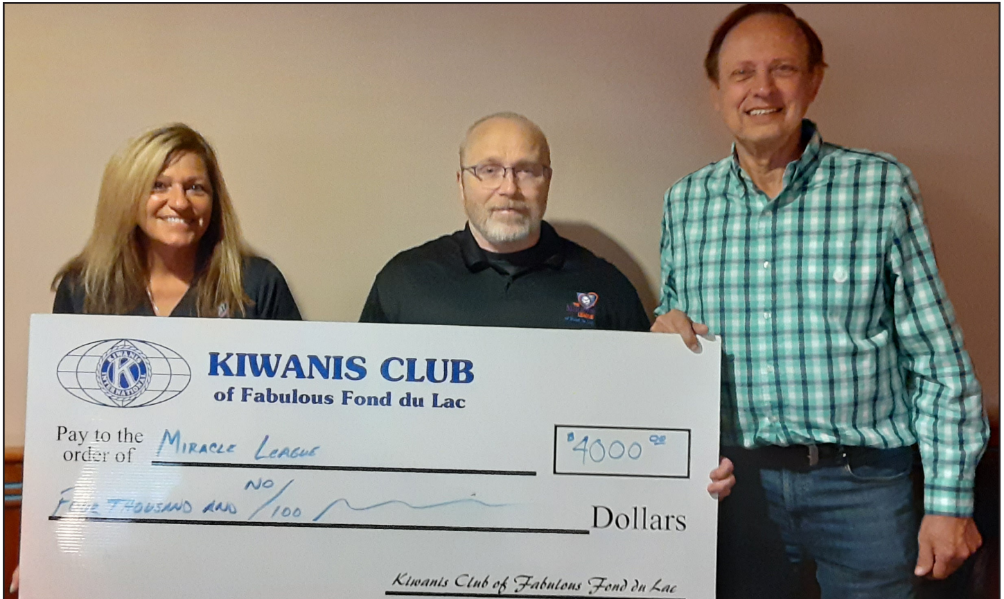
The Miracle League received a $4,000 donation from the Kiwanis Club of Fabulous Fond du Lac following the club's Pork Fest fundraiser.