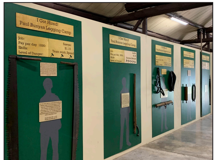
Logging tools and artifacts are on display at the Paul Bunyan Logging Camp within the Wisconsin Logging Museum.