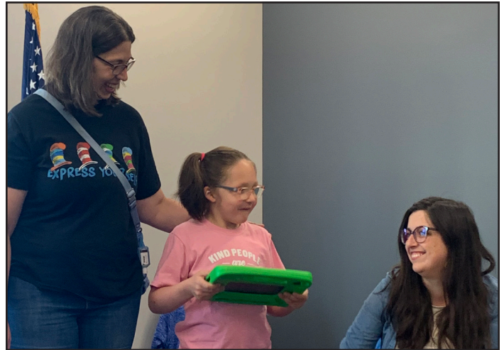
One of the 110 recipients of an iPad awarded by Oshkosh Mid-morning Kiwanis Club members since 2012 smiles as she receives hers.