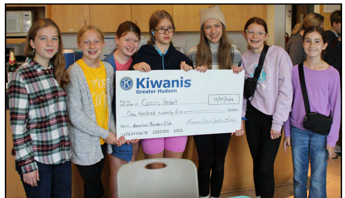
Builders Club members present the proceeds from their first fundraiser/service project to Coco's Heart, a local dog rescue group.

dog treats at the local dog park. They generated $125 in donations for Coco's Heart, a local dog rescue.