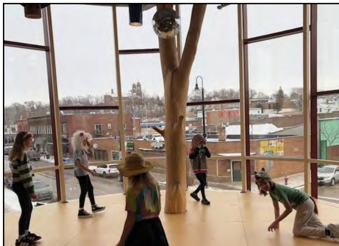
K-Kids and theatre guild volunteers helped act out fairy tales with their audience members ages 3 through 8 at the January reading event.

• Children's Museum of Eau Claire provided the space for the event at no cost to us.