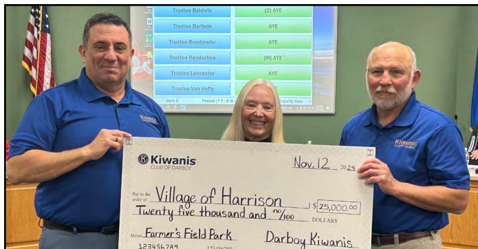
The Kiwanis Club of Darboy donated $25,000 to the Village of Harrison to help fund a new shelter at Farmer's Field Park.

The Darboy club was able to finance these grants with funds it had accumulated over several years through successful fundraising – chiefly a multi-day summer festival that the club hosted for more than 10 years. In the end, two $25,000 grants were awarded to help support ongoing park improvements in the Darboy area.