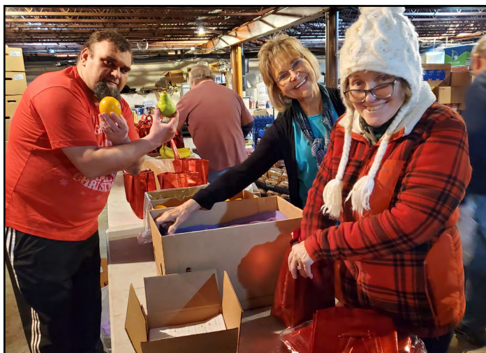
Wisconsin Dells Kiwanians assembling bags of fruit for seniors and food boxes just before Christmas.

Maurer's provides space for the assembly process and stockpiles the food and produce nearby for easy access. Their staff is available to assist as necessary. An assembly line completes filling of the bags and boxes. Boxes of fruit bags are stacked on pallets while food boxes with perishable items are temporarily stored in a walk-in cooler until ready for delivery. Club members prepared 110 individual fruit bags, several large boxes of mixed