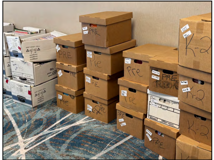
Nearly 200 boxes of books were donated to the Kiwanis 'n Cops 'n Kids program by the Cops 'n Kids Reading Center in Racine.

A note from Cops 'n Kids Reading Center: We appreciate the work your clubs have done and will continue to do for