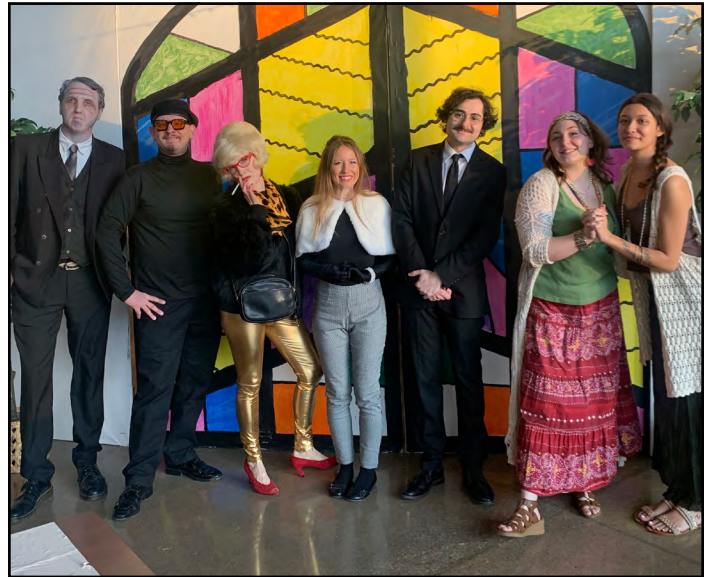
The Ripon Noon Kiwanis Club partnered with Ripon Area Community Theatre, Ripon Key Club and Ripon High School Social Justice Alliance on a murder mystery dinner as a fundraiser for the two Ripon Area School District organizations.

The dinner was a fundraiser for the Key Club and SJA. Actors from the community theatre, some of whom are Kiwanians, hosted an interactive murder mystery. The mystery was set during a wedding in the 1960s and guests were encouraged to dress in costume. Actors mingled and interacted with guests in character, to help provide insight into the story playing out, providing clues and casting suspicion on themselves or other characters.