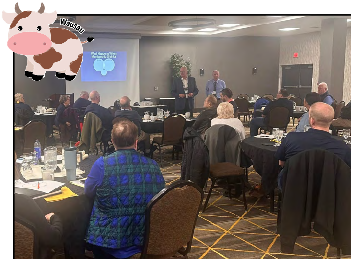
One of the presentations at the midyear conference in Wausau addressed the decline in club membership.