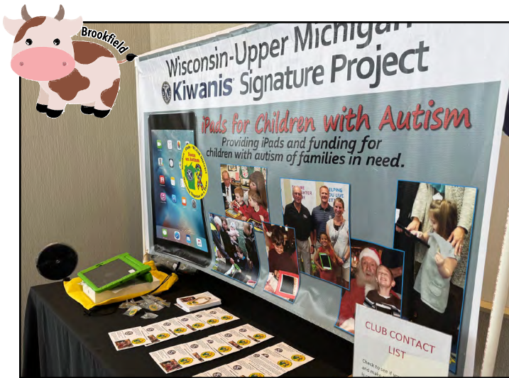
The district's iPads for Autism Signature Project was launched in 2012.