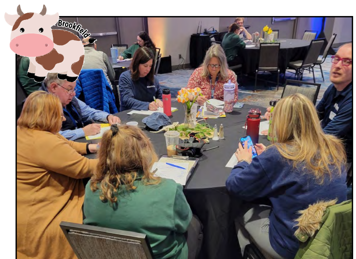
Groups assembled to collaborate on Kiwanis goals.