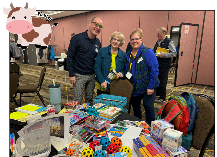
District service project participants created themed kits for families staying at the Ronald McDonald House.