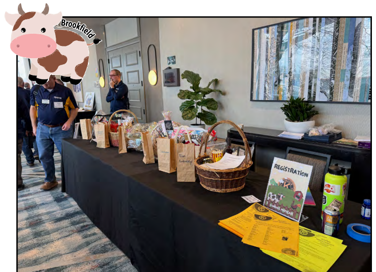
Attendees chose from many donated baskets during the KDF raffle.