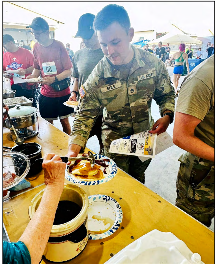
A Kiwanis volunteer provides pancake syrup to a breakfast customer.

The pancake breakfast not only brought people together but also helped raise awareness for local initiatives and future events that support youth and families throughout central Wisconsin.