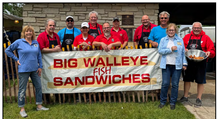
Fond du Lac's Lakeside Evening Kiwanis Club members serve the world's largest fish fry every year during the Walleye Weekend festival.