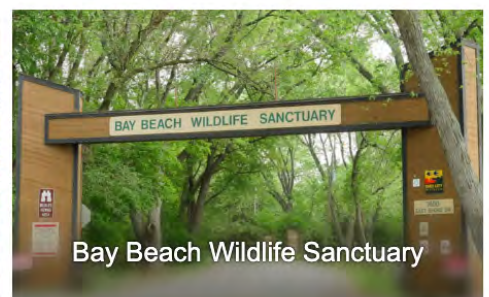
Bay Beach Wildlife Sanctuary