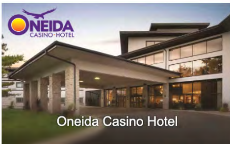
Oneida Casino Hotel

and rides at Bay Beach are on your own. Tour departs the hotel at 8:30am and returns to the hotel by 3pm. Register online at k30.site.kiwanis.org/dcon no later than August 1, 2025. You'll be glad you did!