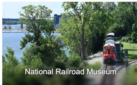
National Railroad Museum