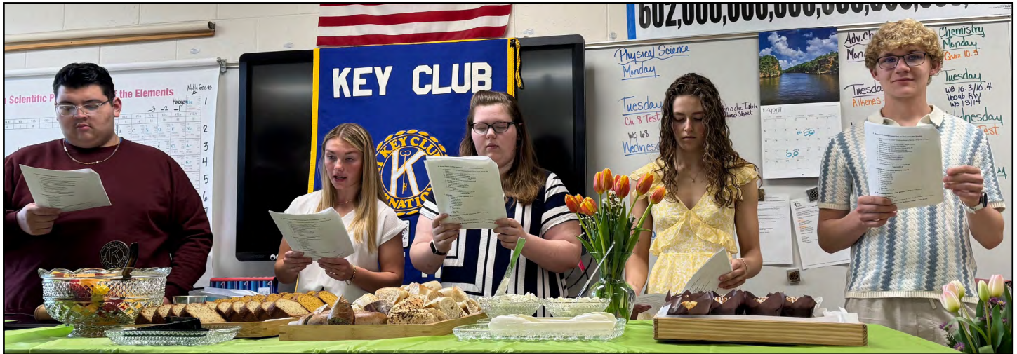
North Fond du Lac Horace Mann Key Club officers celebrate the club's accomplishments during the year-end club review.