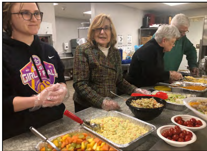
Volunteers from the Kiwanis Club of West Racine, with assistance from Key Club and other community members, provide monthly meals.

The enduring partnership between the Kiwanis Club of West Racine and HALO is a testament to the power of community collaboration and the profound impact of simple acts of kindness. It's a reminder that a warm meal can offer not just nourishment, but also dignity, hope, and a vital connection to a caring community. HALO is deeply grateful for the Kiwanis club's continued dedication to their mission.