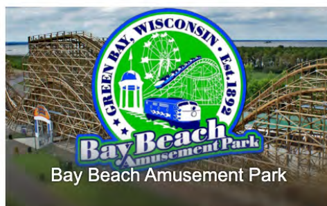
Bay Beach Amusement Park