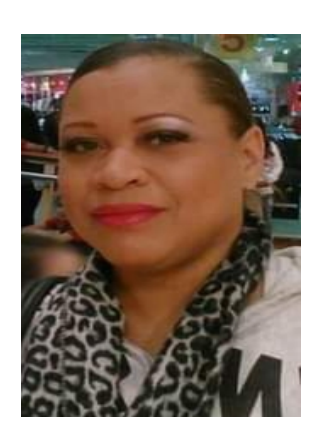
Elana Gardner Governor Elect