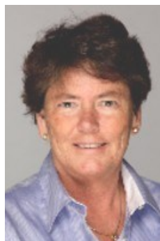
Kiwanis Club Treasurer