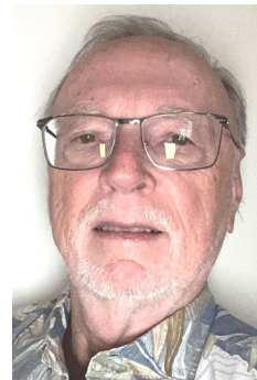
Kiwanis Club Secretary