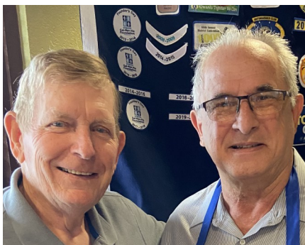
President-Elect and Vice President