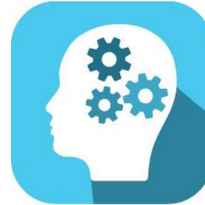
Creative and Critical Thinker