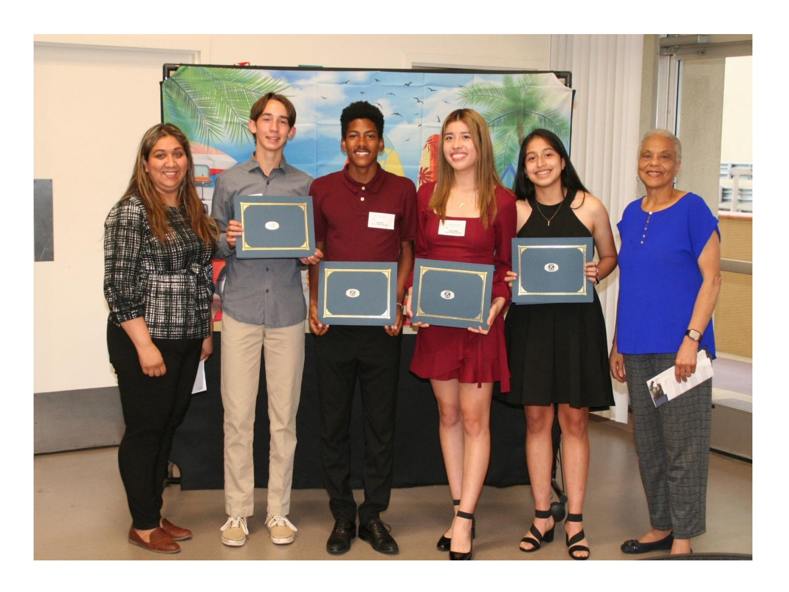
Student Awards 2022