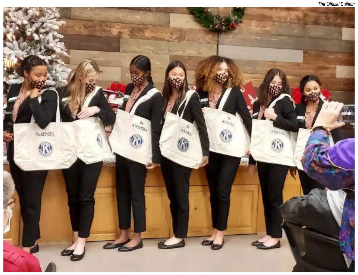
Rose Queen and Court 2022