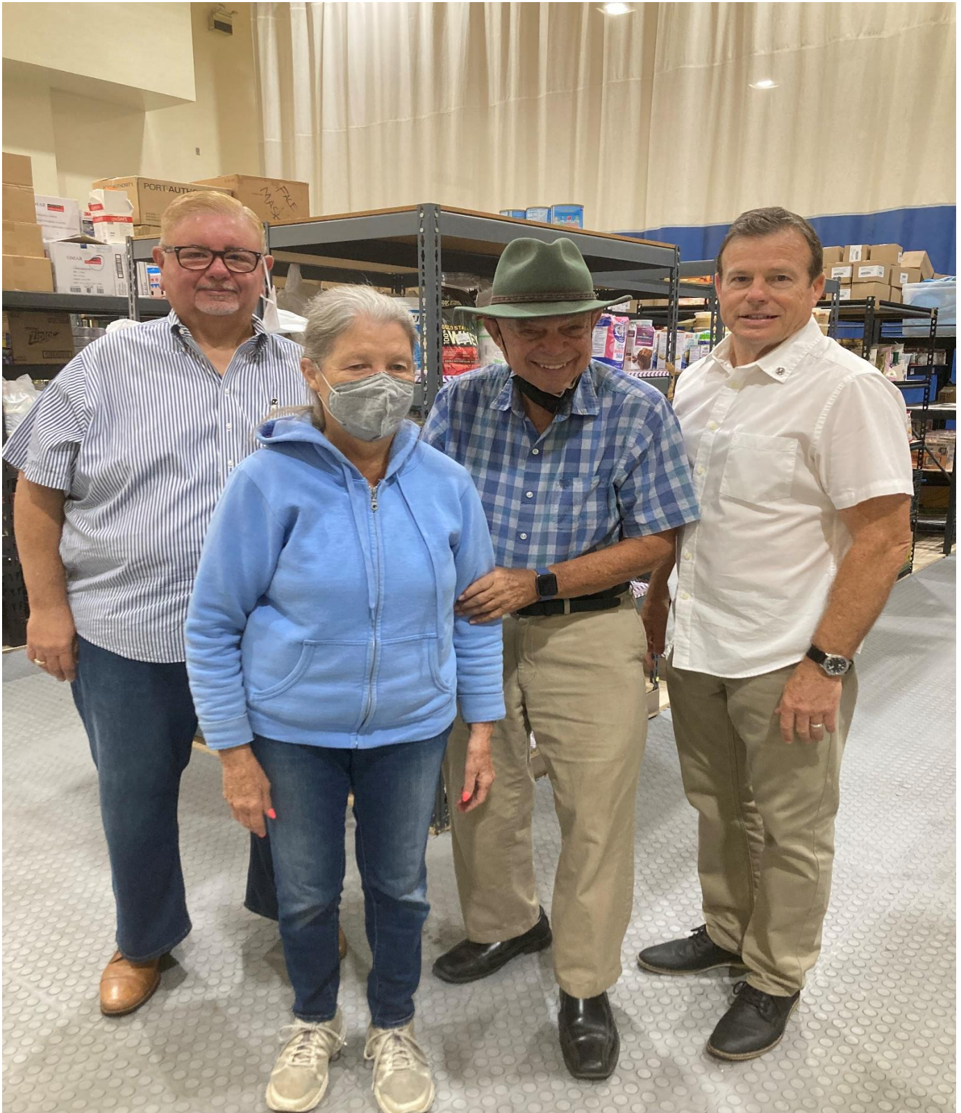
Salvation Army Food Pantry 2022