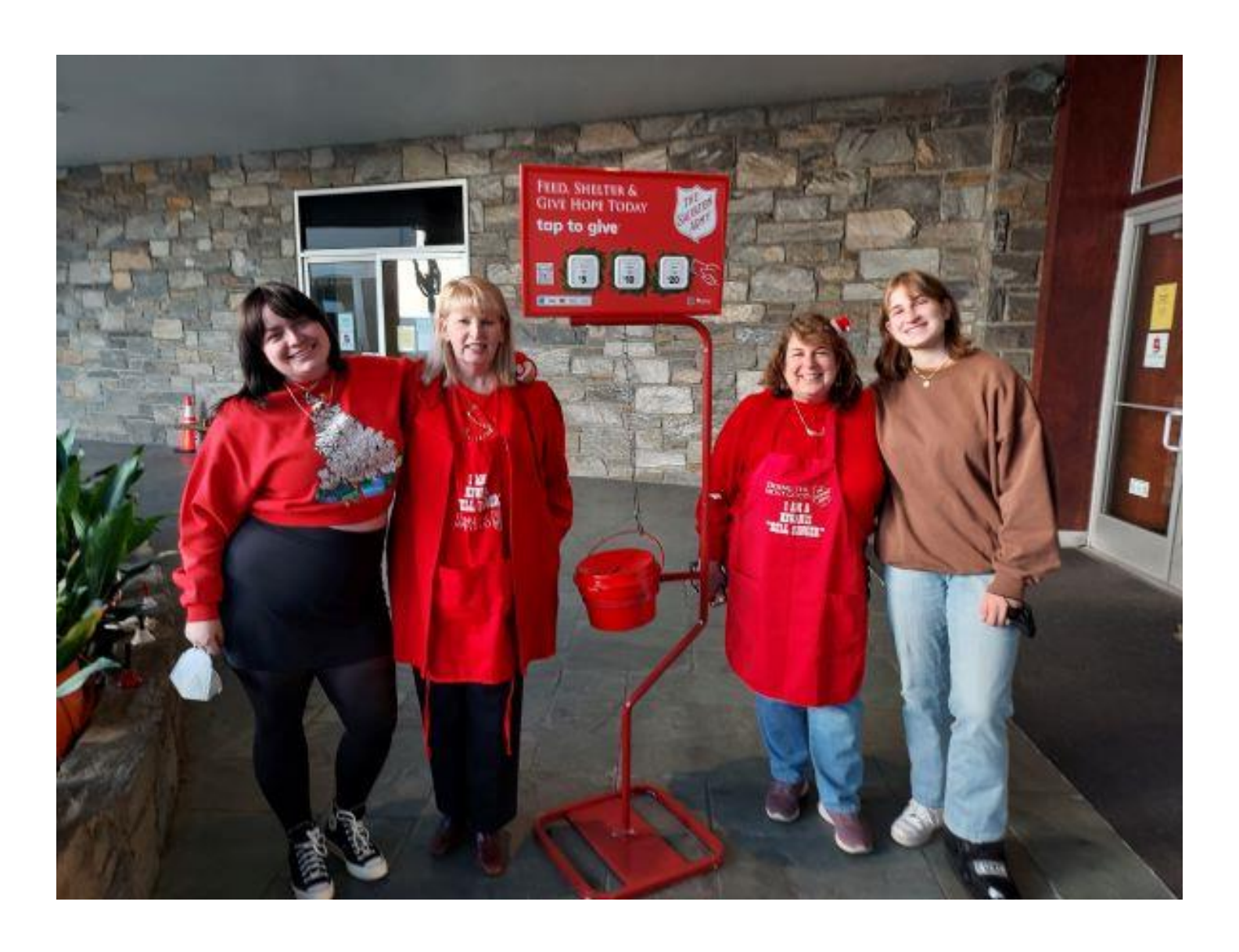
Salvation Army Bell Ringing 2021