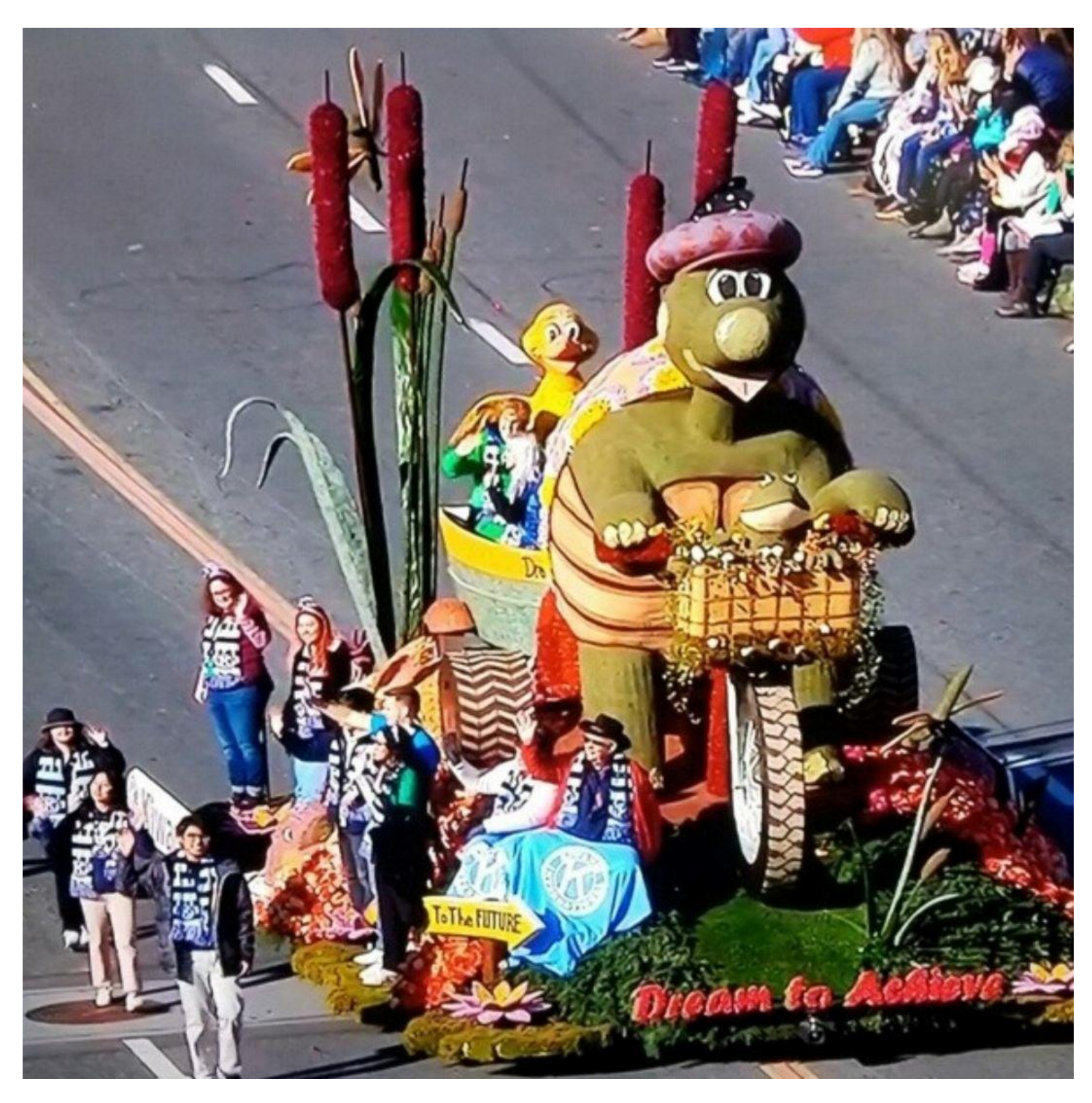
Rose Float Parade 2022