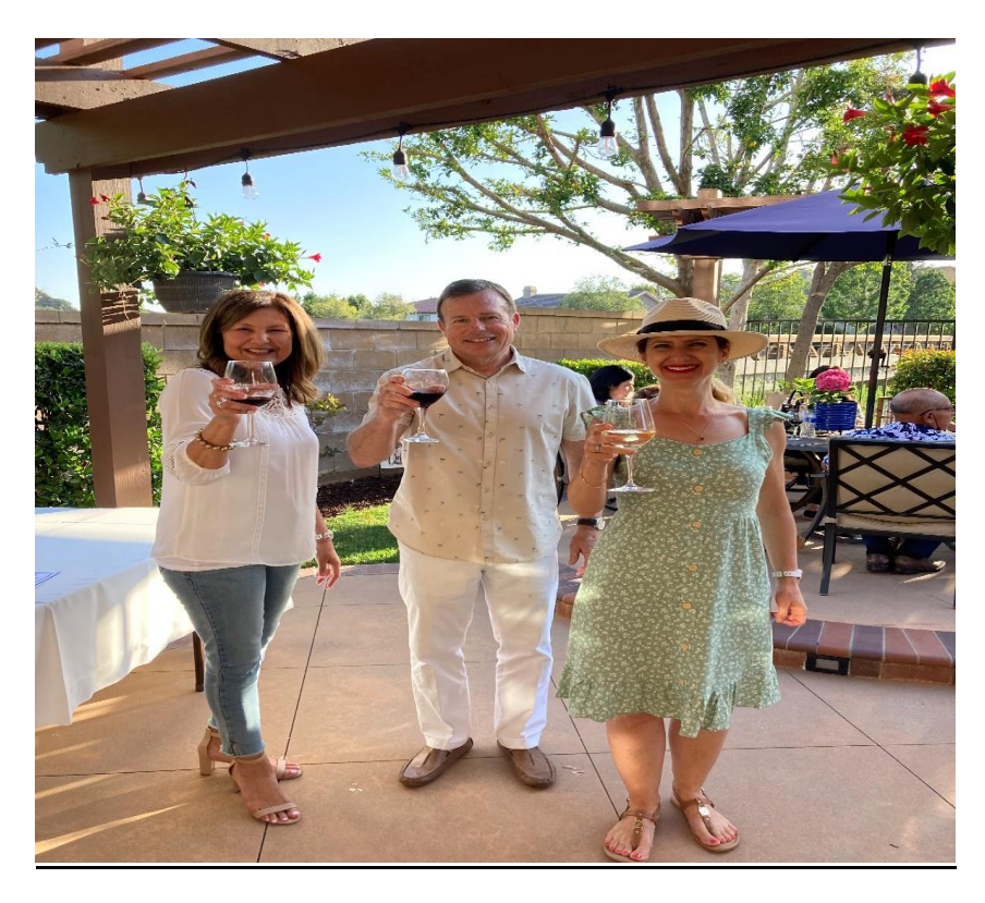
Saturday, May 6th, 2023 is our Annual Wine Tasting Party