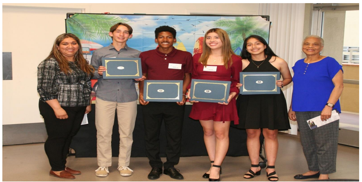
Student Awards 2022