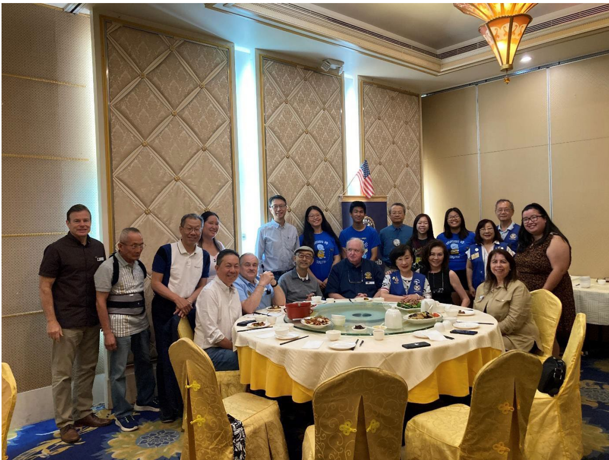
Inter-Club Luncheon with the Monterey Park Club this past week