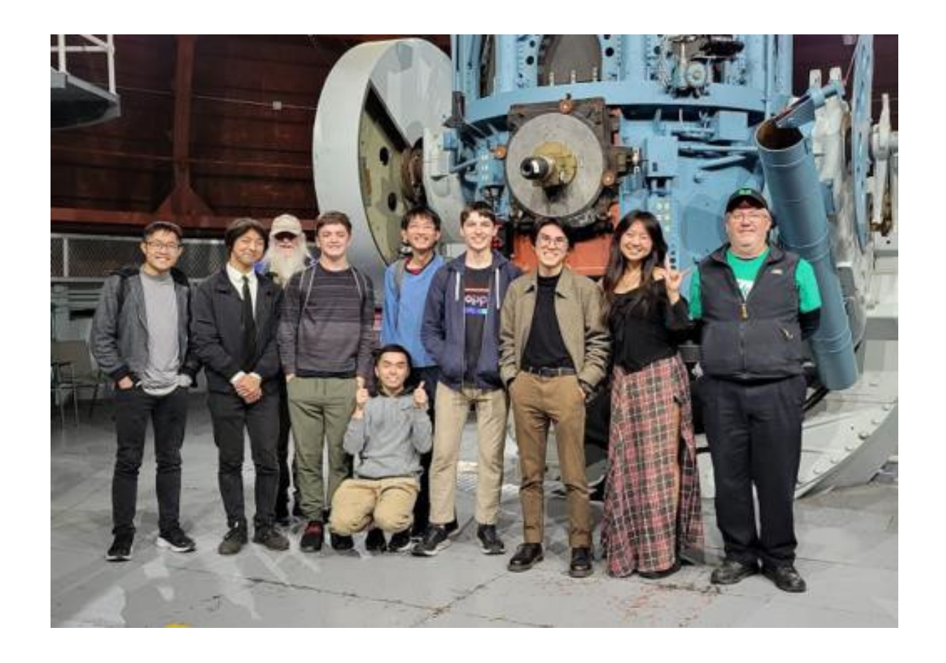
Astronomy Club at Pasadena High School