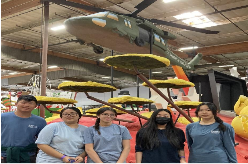
High School Key Club members helping to decorate floats