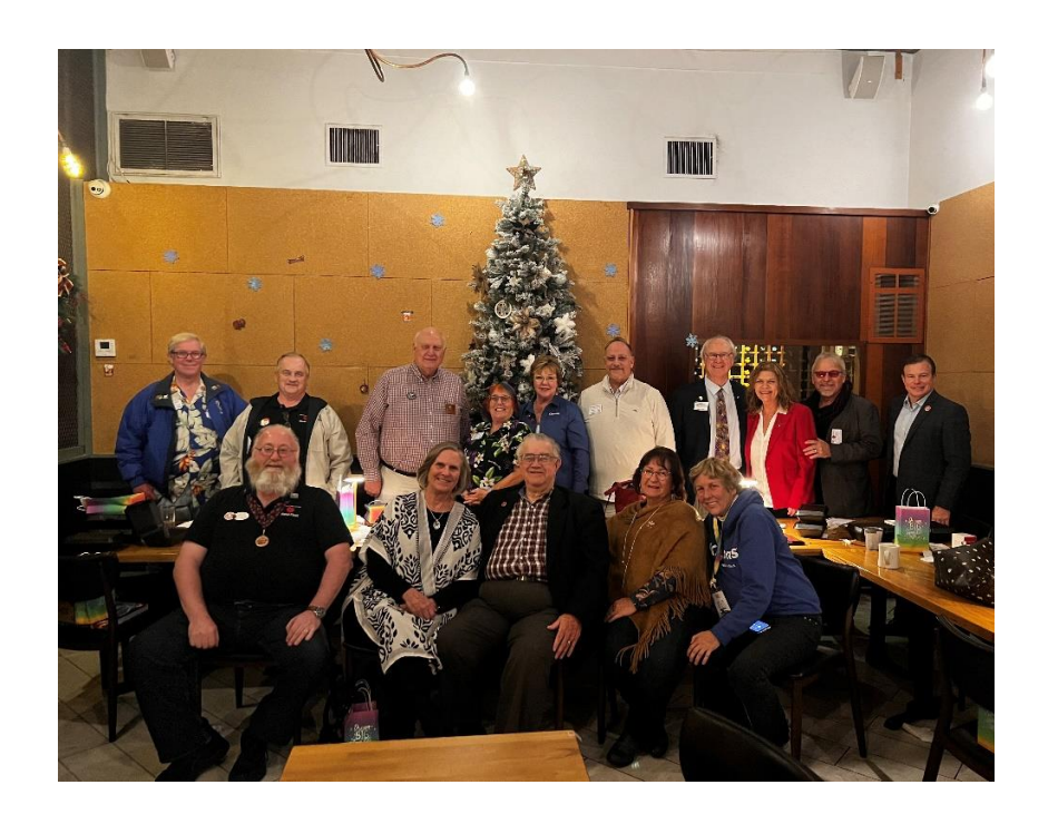
Int'l President's Dinner this past month