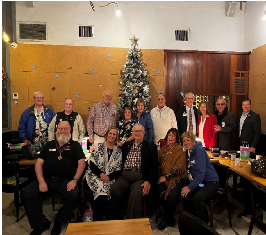
Int'l President's Dinner this past month