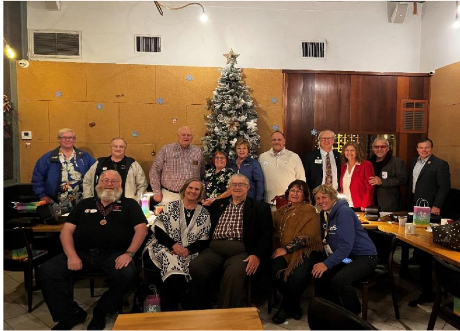
Int'l President's Dinner this past December