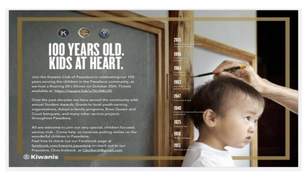
Pasadena Kiwanis Ad in 2023-24