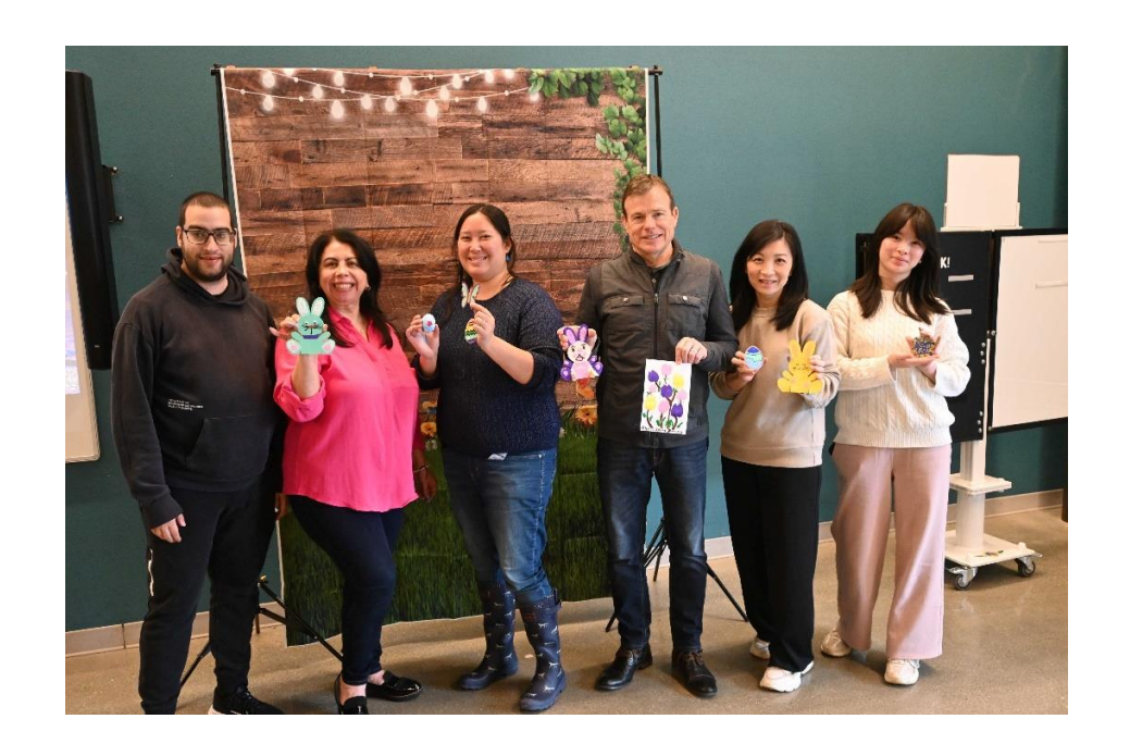
Easter Party at Villa Esperanza

"As we serve others we are working on ourselves; every act, every word, every gesture of genuine compassion naturally nourishes our own hearts as well"