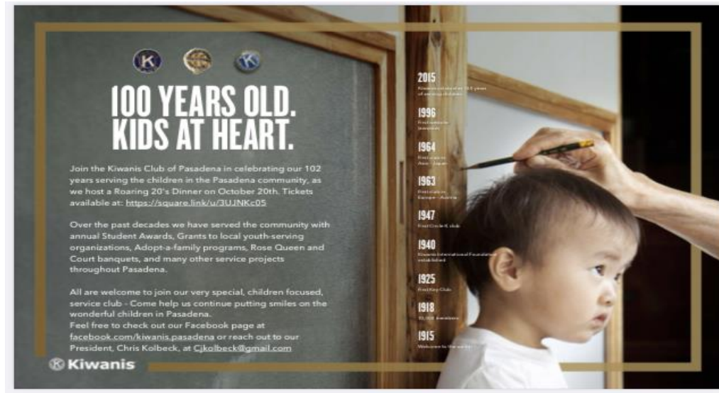
Pasadena Kiwanis Ad in 2023-24