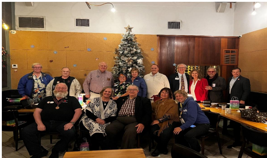
International President's Dinner