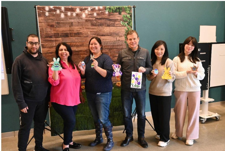
Easter Party at Villa Esperanza

“As we serve others we are working on ourselves; every act, every word, every gesture of genuine compassion naturally nourishes our own hearts as well”