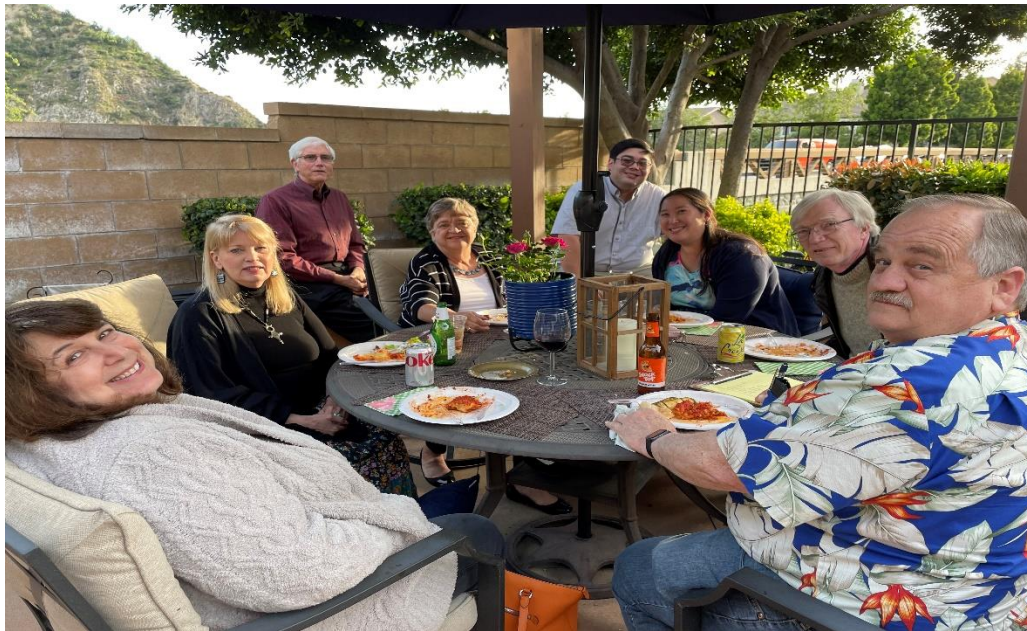
Wine Tasting Party in 2023