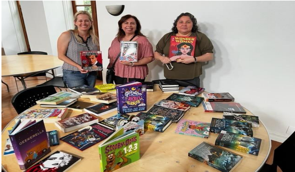
Boys and Girls Club Book Donations