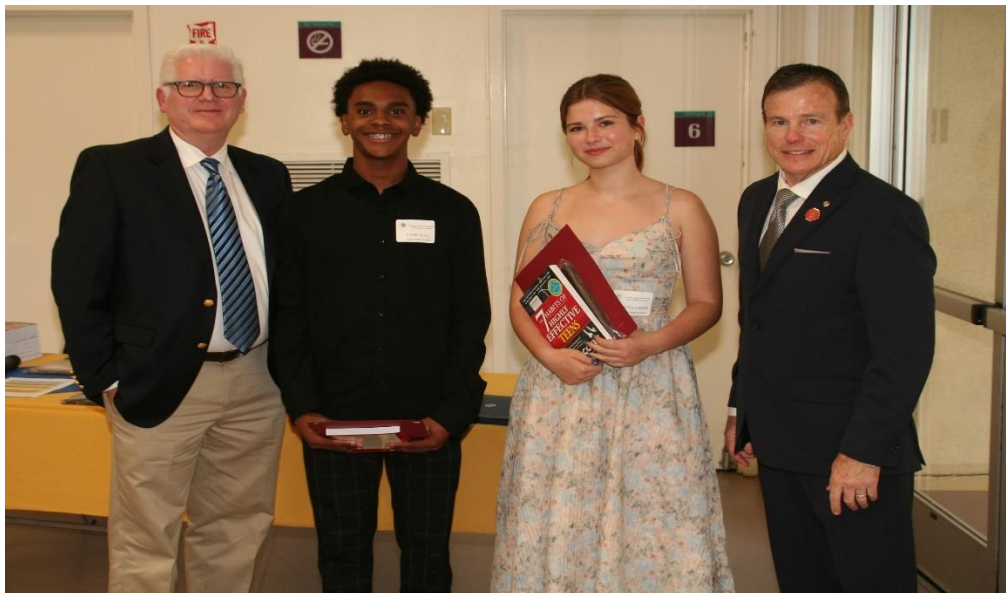
Eliot Arts Academy and Student Awardees