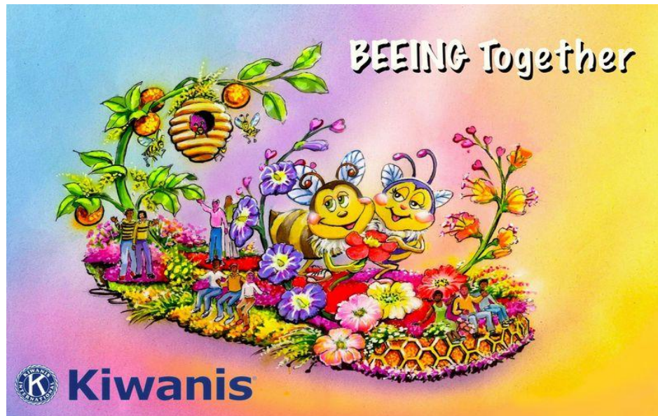
2025 Kiwanis Rose Float