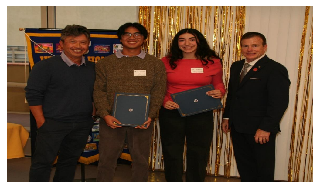
Pasadena High School and Student Awardees