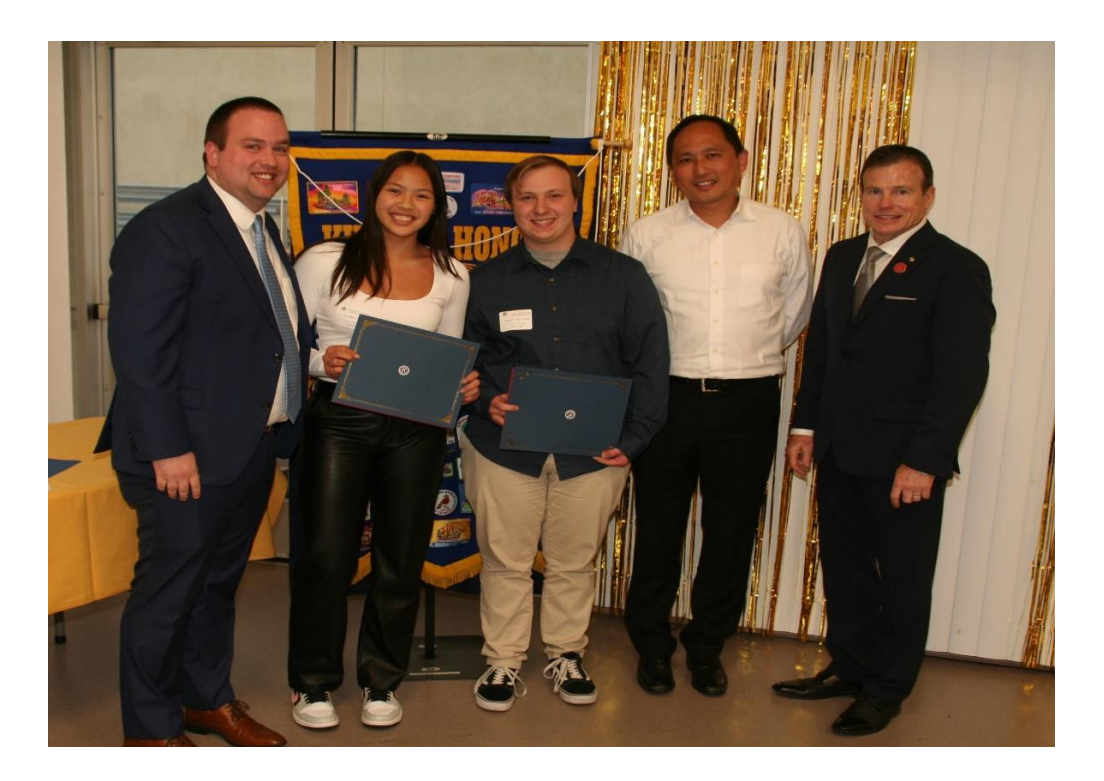
La Salle High School and Student Awardees