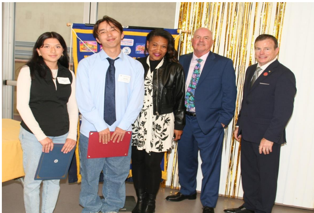
John Muir High School Student Awardees