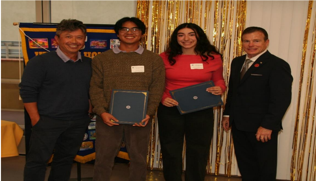
Pasadena High School and Student Awardees