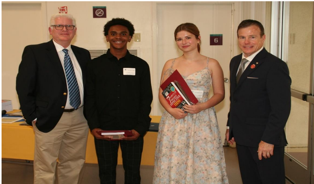
Eliot Arts Academy and Student Awardees