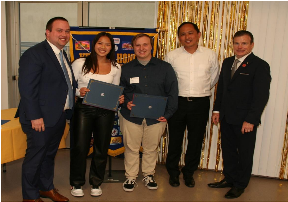
La Salle High School and Student Awardees