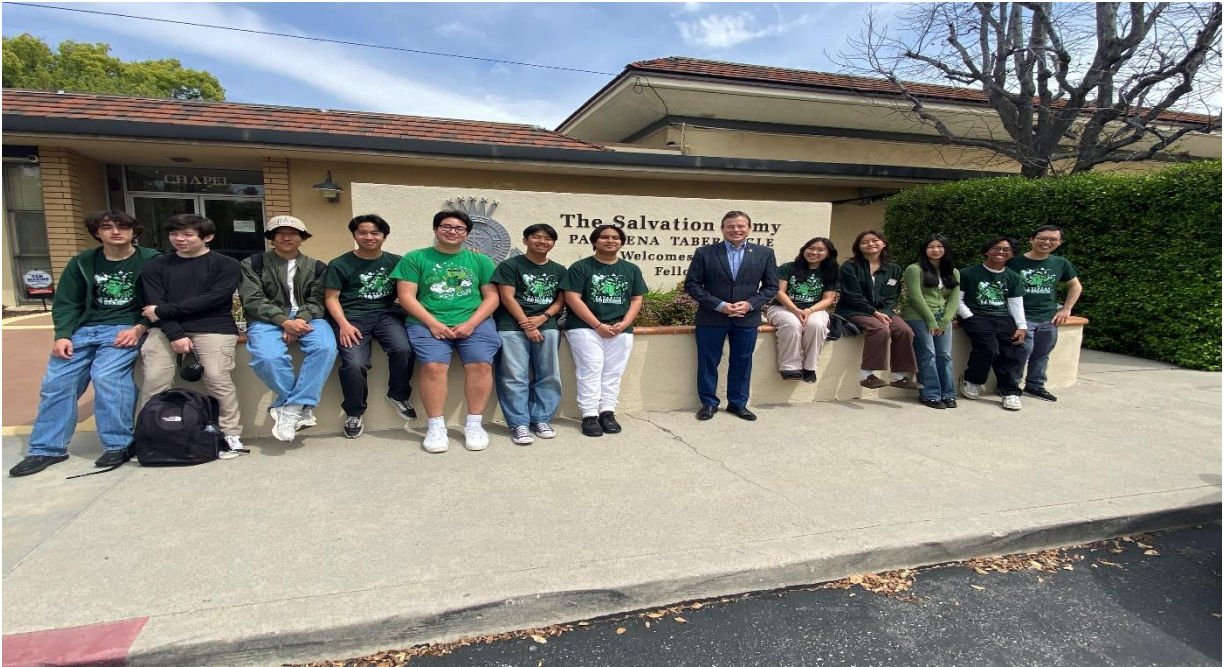
Marshall High School Key Club at Salvation Army