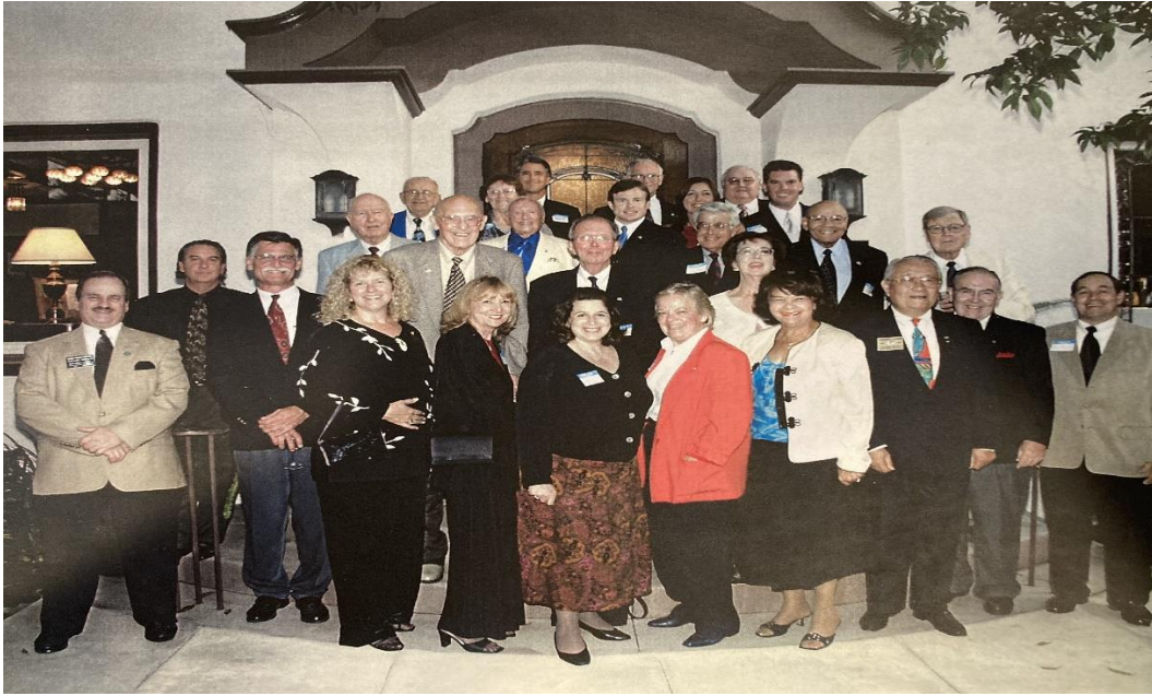
Pasadena Club Event in 2002