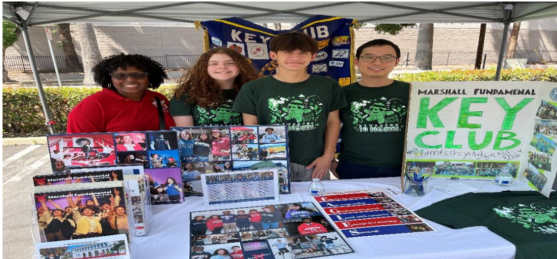
Marshall High School working hard at our Public Safety Fair