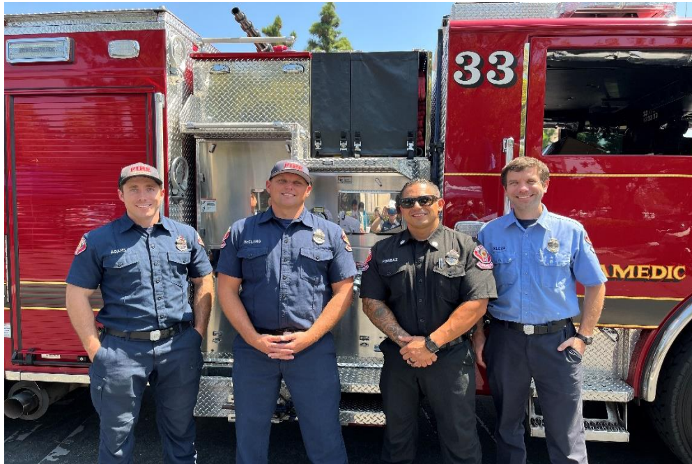
Pasadena Fire Dept Engine 33 Firemen helping at our Public Safety Fair