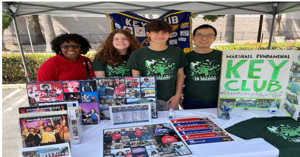
Marshall High School working hard at our Public Safety Fair