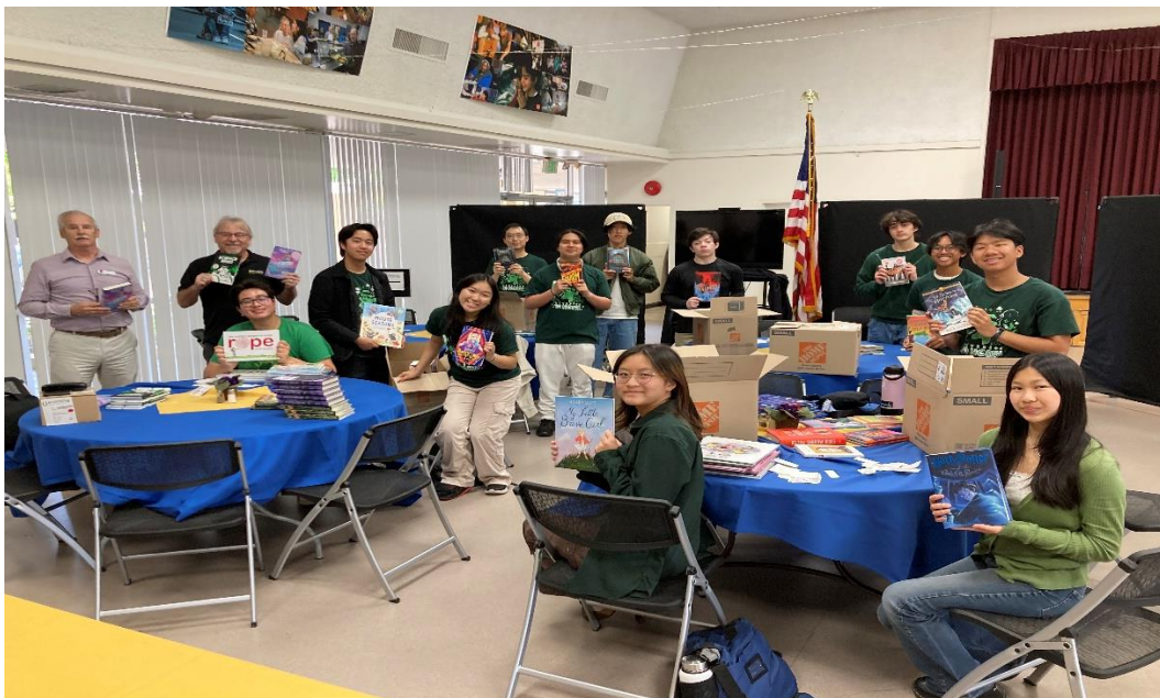
Marshall High School Key Club members labeling new books for donations

“As we serve others we are working on ourselves; every act, every word and every gesture of genuine compassion naturally nourishes our own hearts as well”