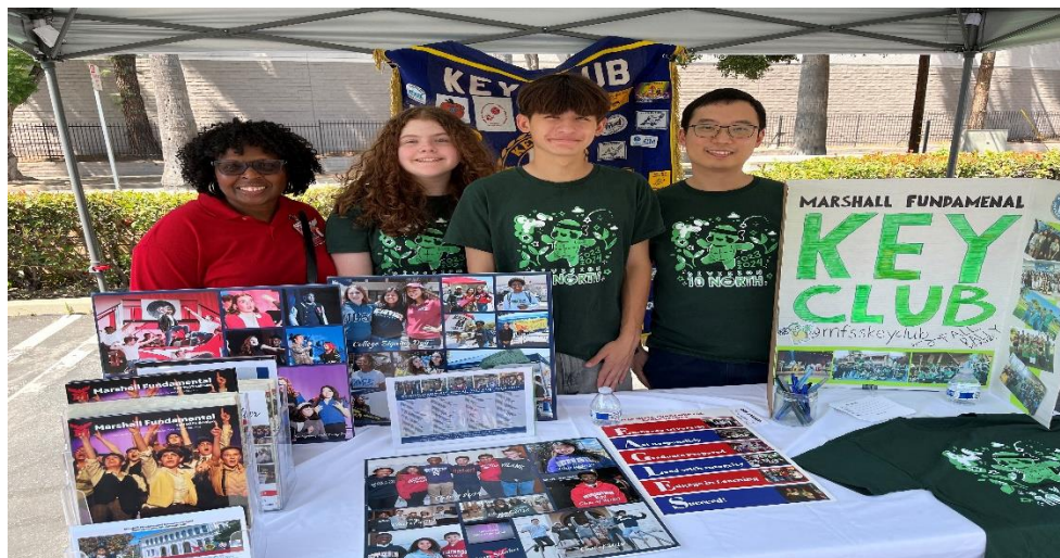
Marshall High School working hard at our Public Safety Fair