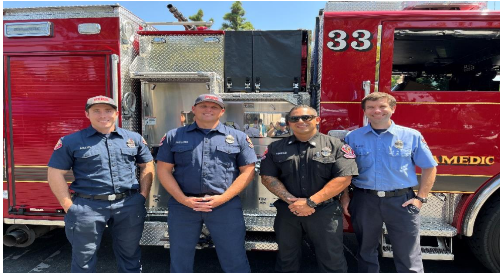
Pasadena Fire Dept Engine 33 Firemen helping at our Public Safety Fair