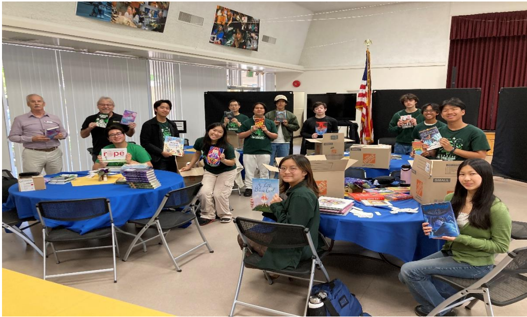
Marshall High School Key Club members labeling new books for donations