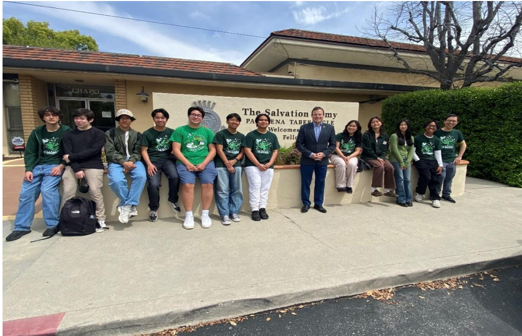
Marshall High School Key Club at Salvation Army