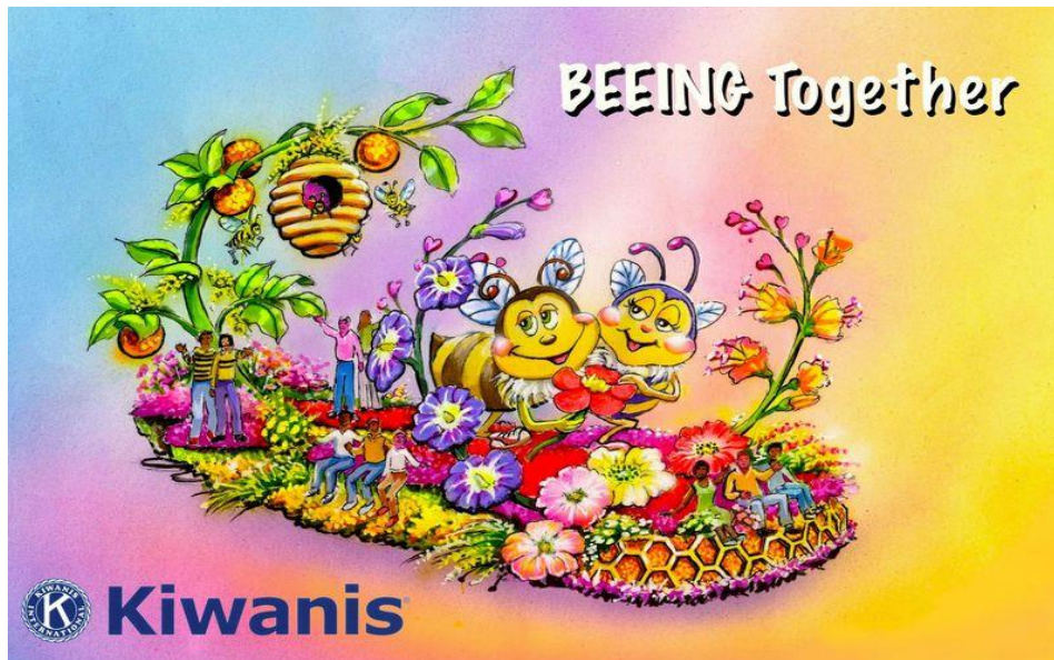
2025 Kiwanis Rose Float

“You make a living by what you earn; You make a life by what you give”