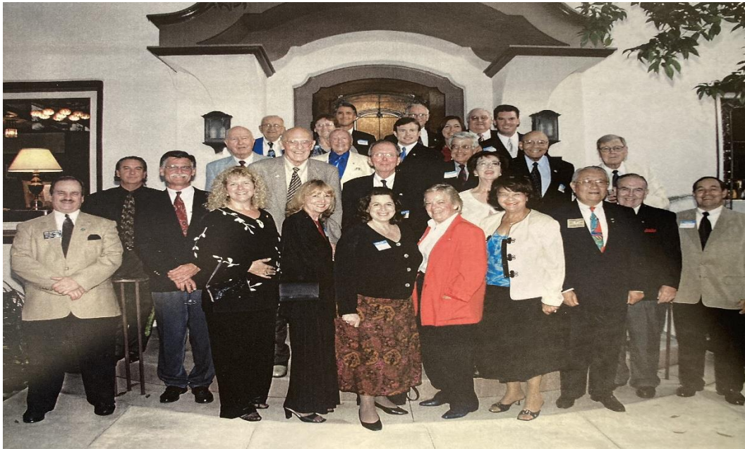
Pasadena Club Event in 2002