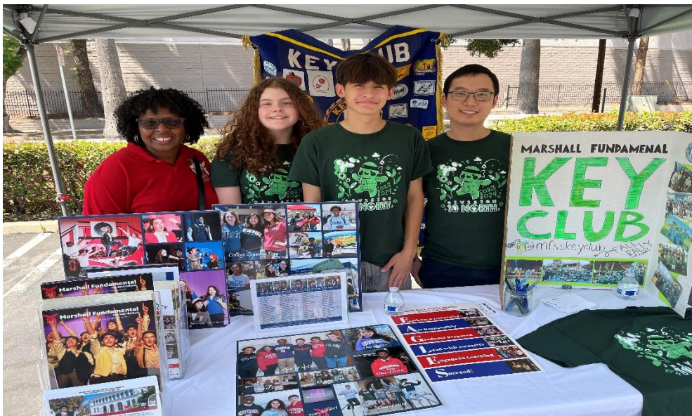
Marshall Key Club at the Public Safety Fair