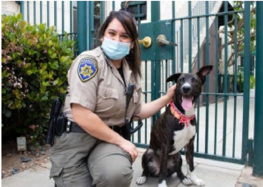
Pasadena Humane Society Officer and Friend