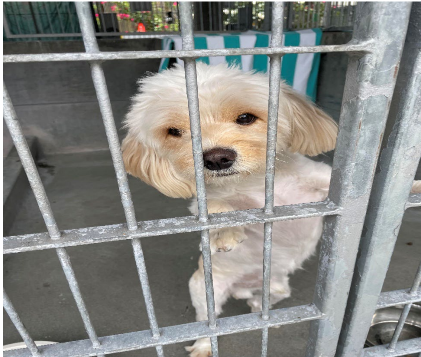
Humane Society puppy looking for a home