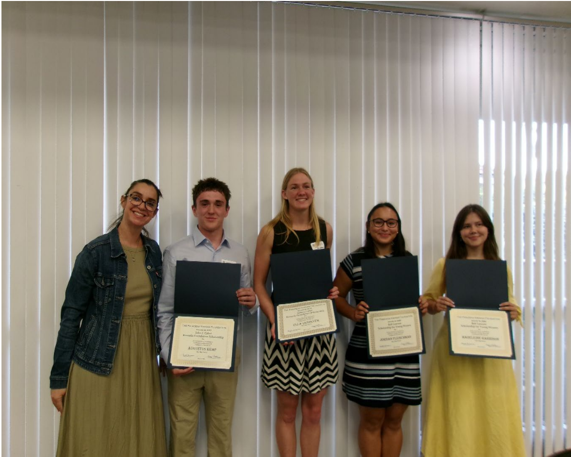
Students being honored at our May Kiwanis Student Awards