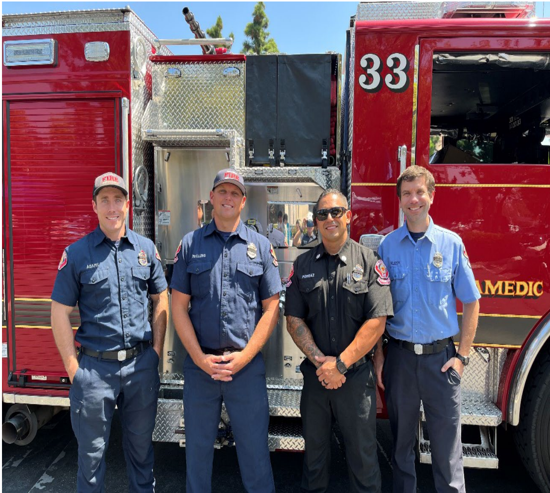
Pasadena Firemen who have been working so hard with the recent fires