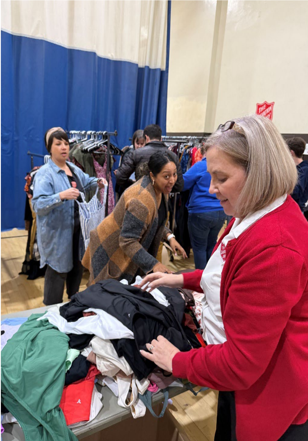
Volunteers at Salvation Army with clothing donations for fire victims