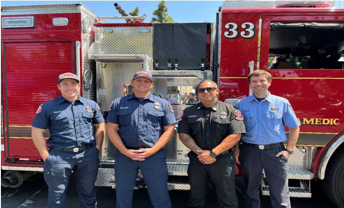
Pasadena Firemen who have been working so hard with the recent fires