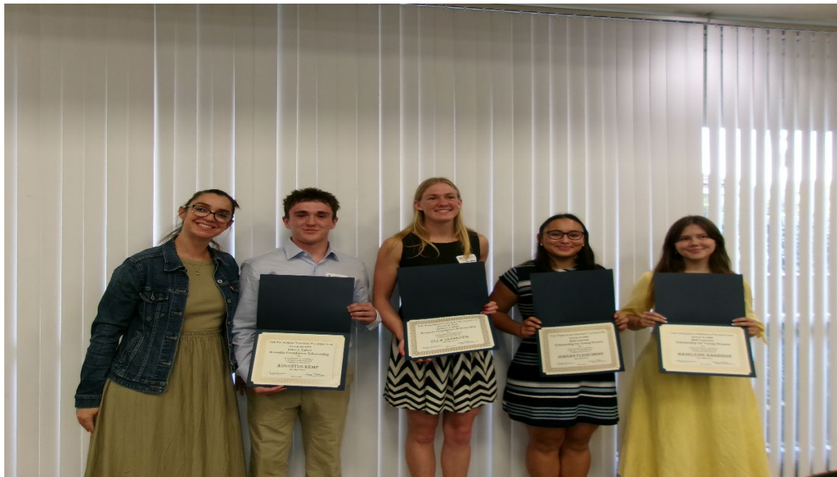
Students being honored at our May Kiwanis Student Awards