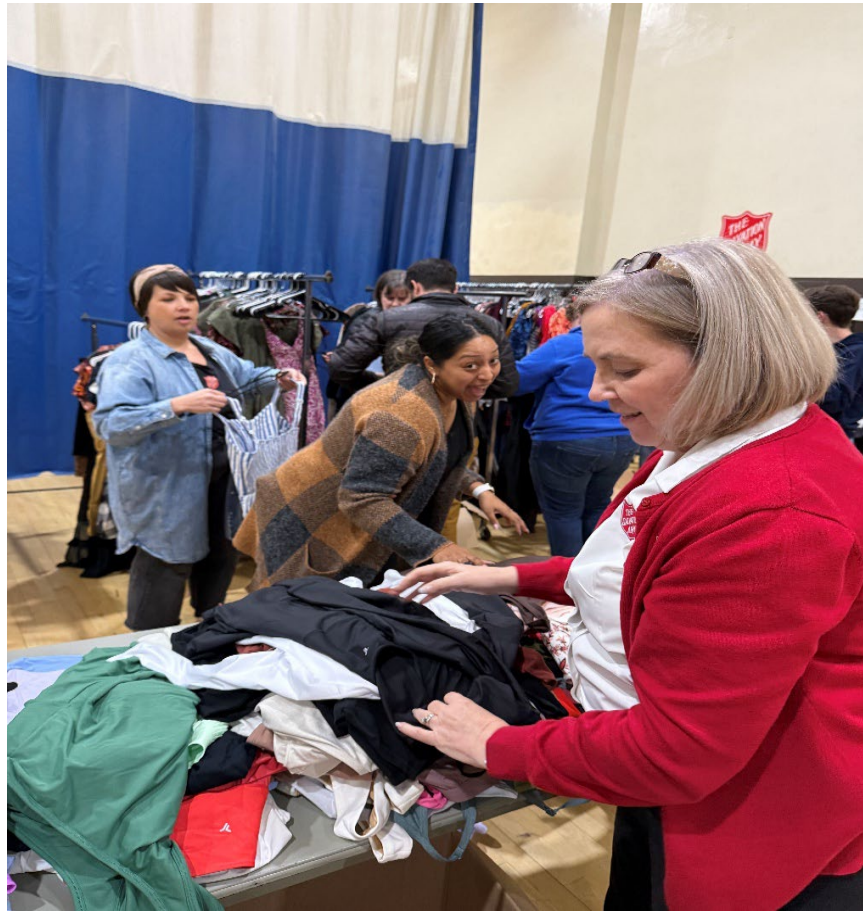
Volunteers at Salvation Army with clothing donations for fire victims