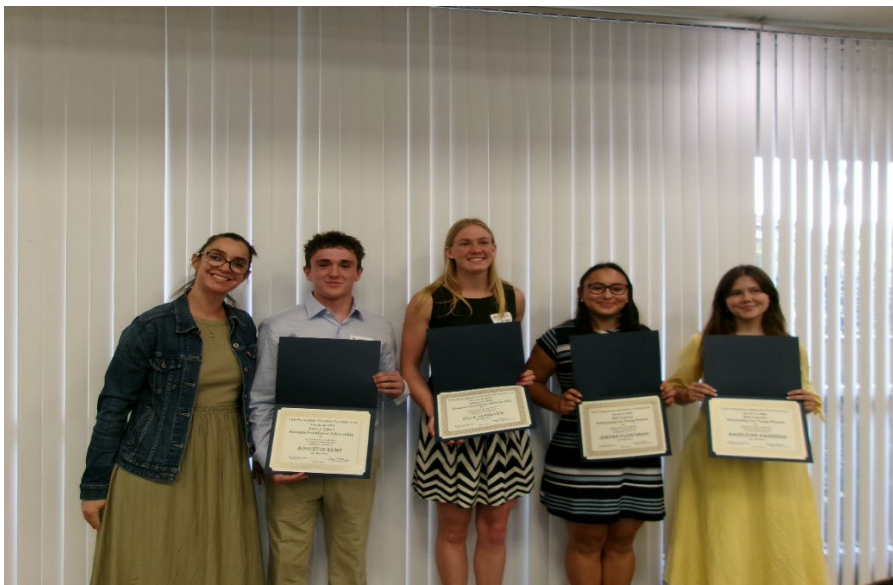
Students being honored at our May Kiwanis Student Awards