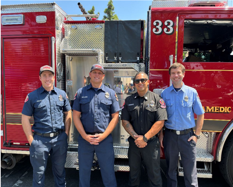
Pasadena Firemen who have been working so hard with the recent fires