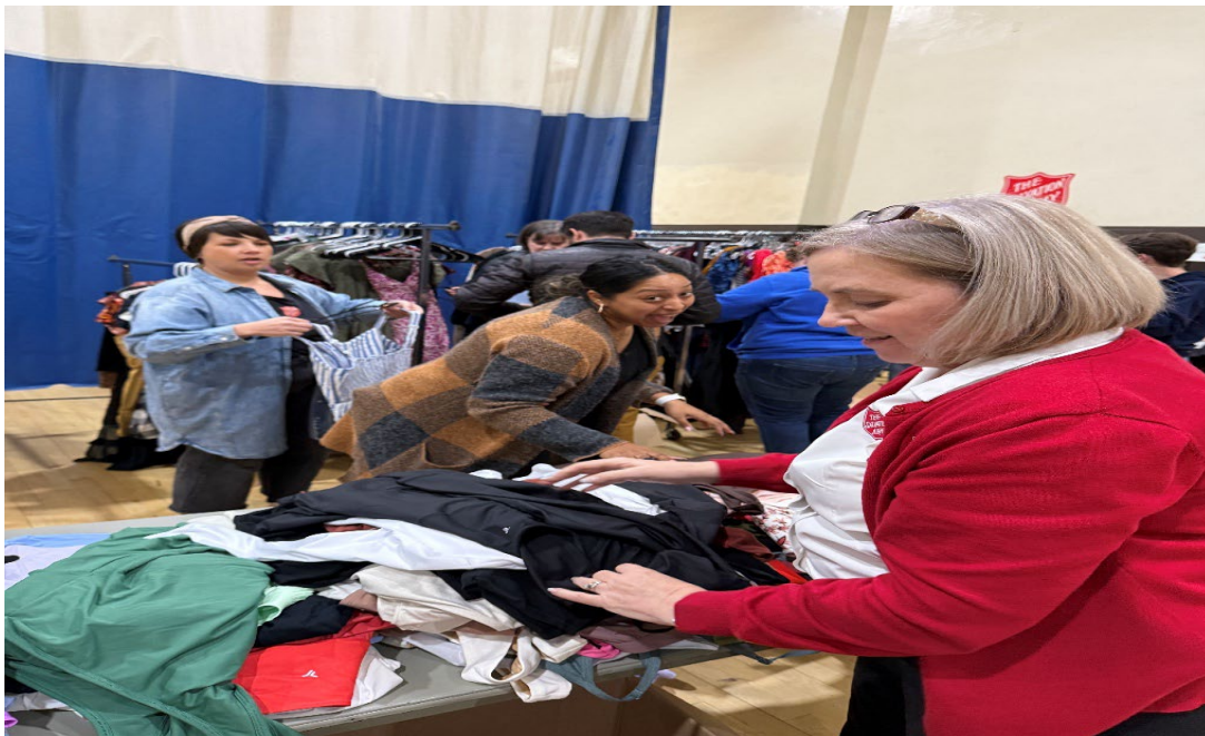
Volunteers at Salvation Army with clothing donations for fire victims

Members earn $4 credit for each hour of service