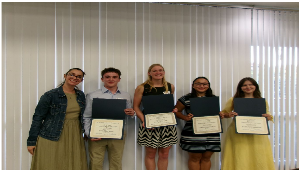
Students being honored at last week's Kiwanis Student Awards