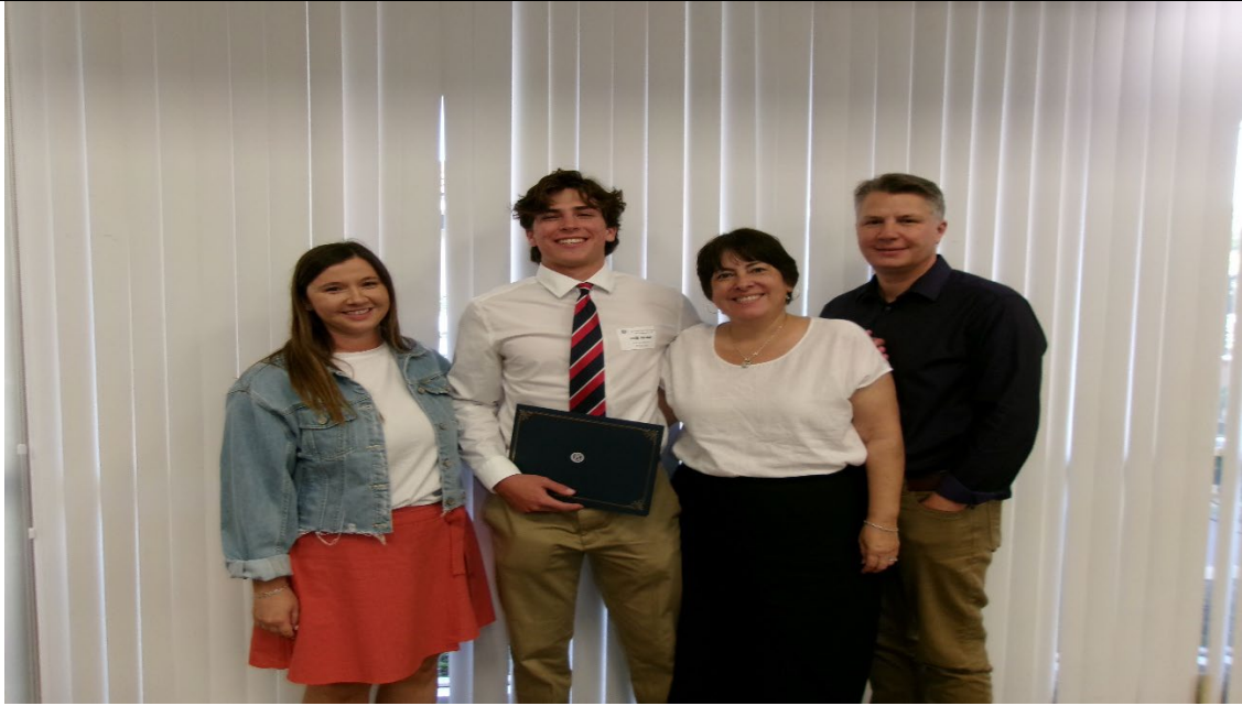
Students being honored at last week's Kiwanis Student Awards