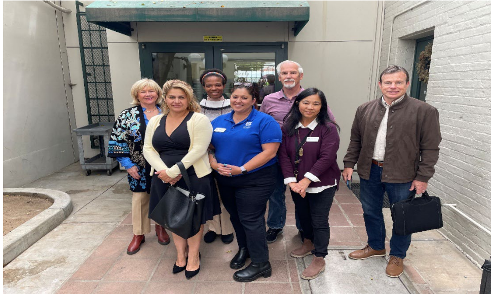
Lunch Gathering at the Pasadena Humane' Animal Shelter