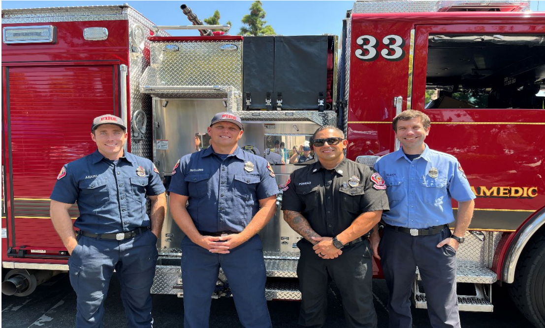
Pasadena Firemen who have been working so hard with the recent fires