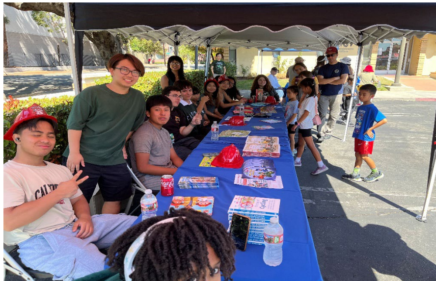
Marshall High School Key Club helping at our Children's Safety Fair