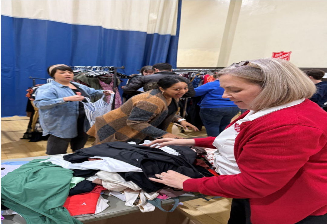
Volunteers at Salvation Army with clothing donations for fire victims