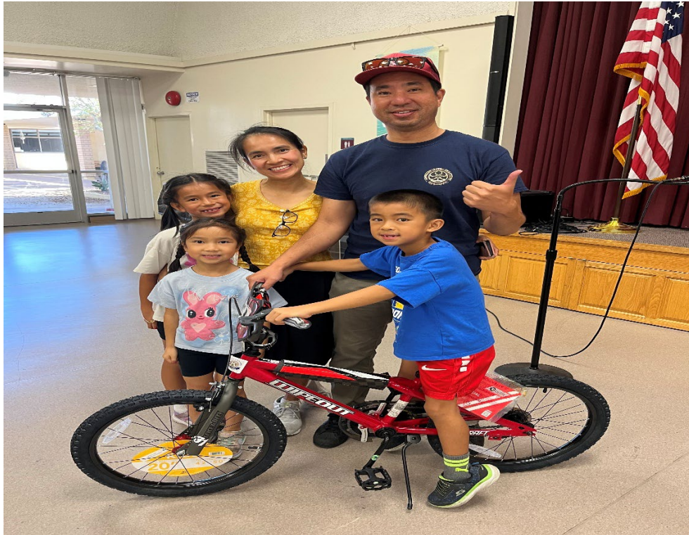
Family winning a free bike in our Children's Safety Fair