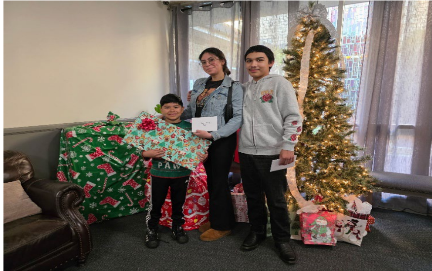
Adopt-a-family receiving gifts last week from the Club