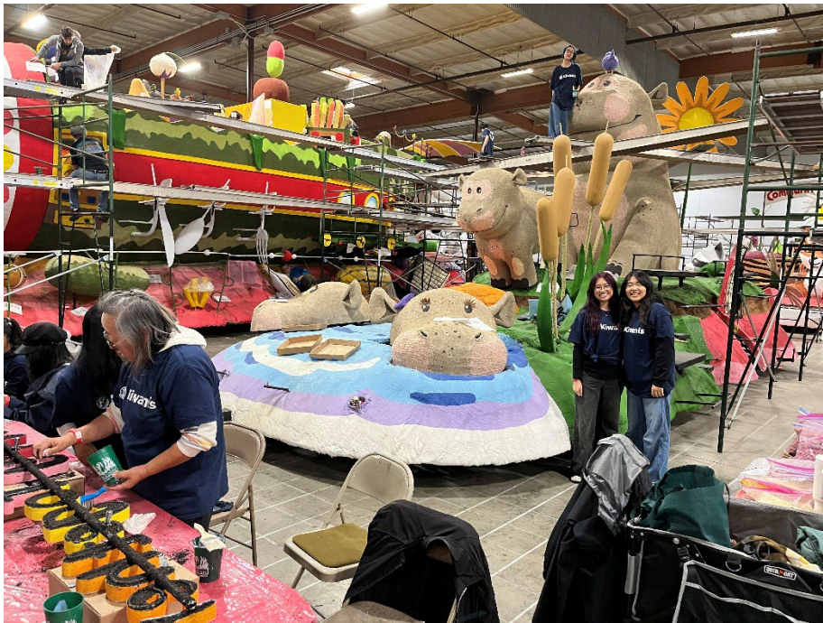
Key Club members helping to decorate our 2026 Kiwanis Float