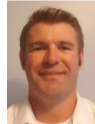
President Andy Johnson